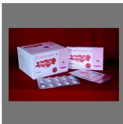
Ferrous Ascorbate, Folic Acid and Zinc Tablets