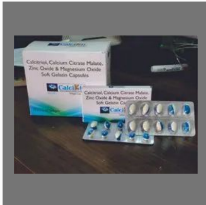
CALCIKIT SOFT GELATIN CAPSULE