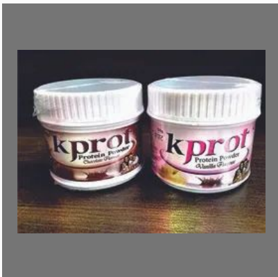
Protein Powder Sugar Free