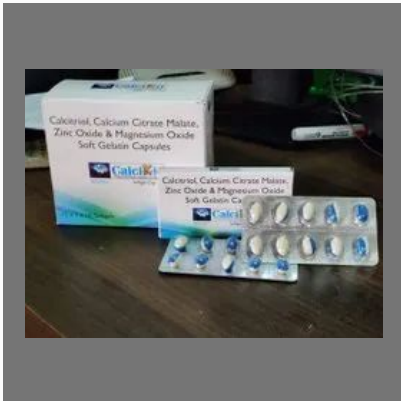
Cholecalciferol, Calcium Citrate & Zinc Soft Gelatin Capsule