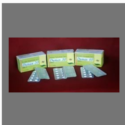
Duloxetine HCL Tablets (DUMAX) TABLET