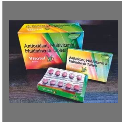
Multivitamins, Antioxidants, Minerals