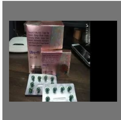
ULTRA-4G SOFT GELATIN CAPSULE