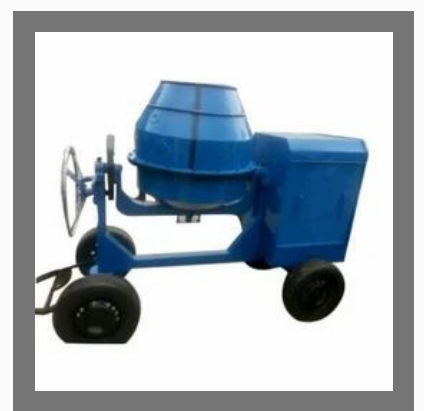
Concrete Mixer Machine