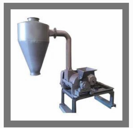
Micro Pulverizer Machine