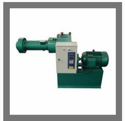
Rubber Extruder Machines