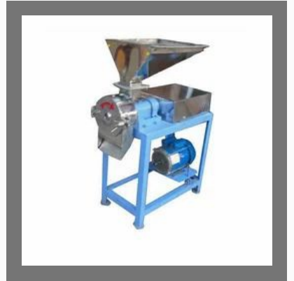
Micro Pulverizer Machine