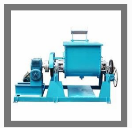
Sigma Mixer Machine