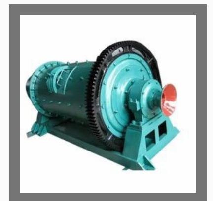
Ball Mill Machine