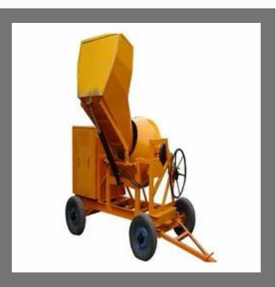
Hydraulic Concrete Mixer Machine