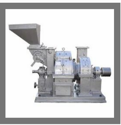
Heavy Duty Pulverizer Machine