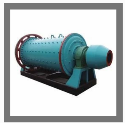
Heavy Duty Ball Mill Machine