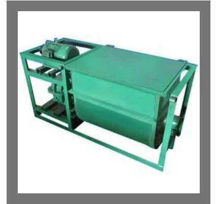
Powder Mixer Machine