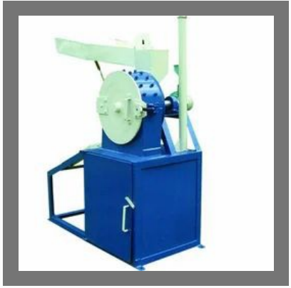
Multipurpose Pulverizer Machine