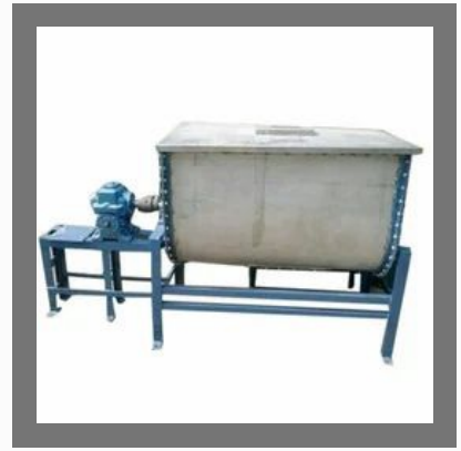
Detergent Powder Mixer Machine