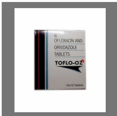
Toflo Oz Tab