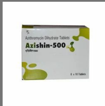
Azithromycin Dihydrate Tablets