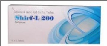
Shif L 200 Tab