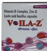
Vitamin B-complex & Zinc