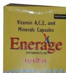
Vitamin A,C,E and Minerals Capsules