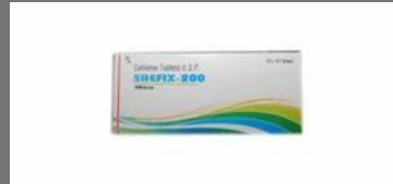
Shiflex 200 Tab