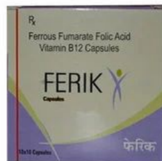
Ferrous Fumarate, Folic Acid and Vitamin B12 Capsules