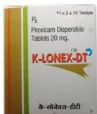
K-lonex DT Tab