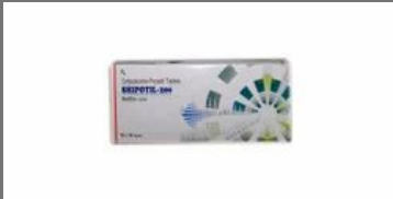
Shipotil 200 Tab