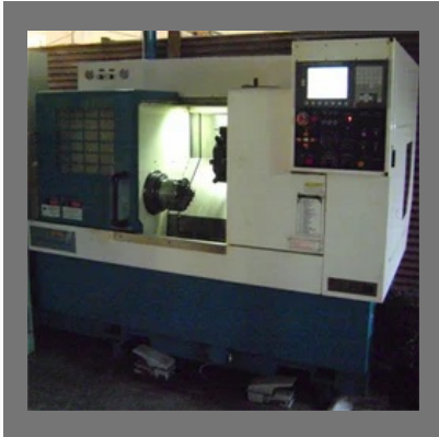
Cnc Turning Center