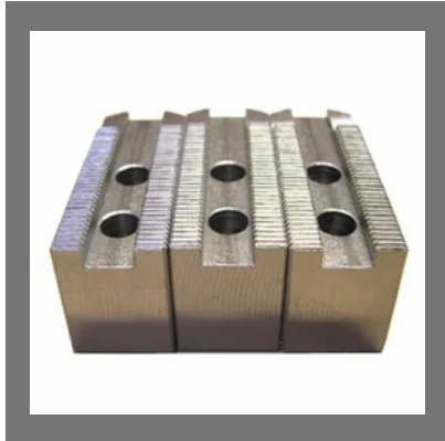
Soft Jaw Cnc