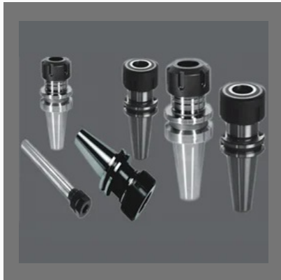
Bt 40 Holders