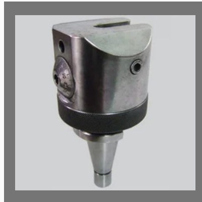
Micro Boring Head