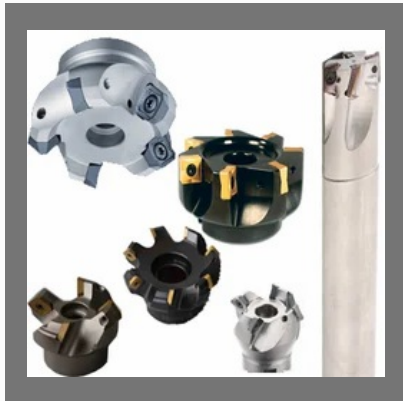
Indexable Milling Cutters