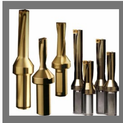
Indexable(u & Core) Drills