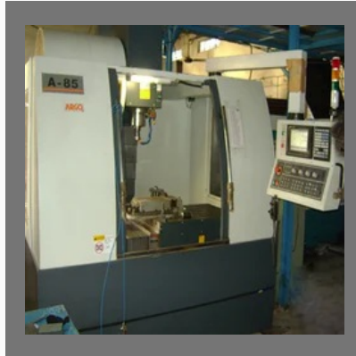
Vertical Machining Center