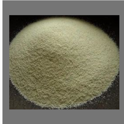
Nutrition Suji Flour