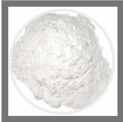
White Maida Flour