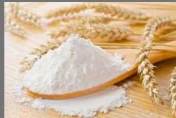
Fresh Chakki Atta