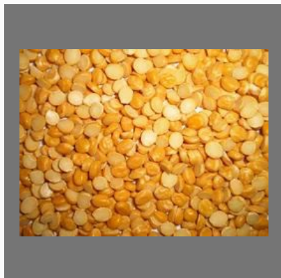
Split Chana Dal