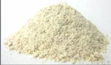
Wheat Chakki Atta