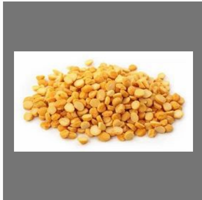
Medium Chana Dal