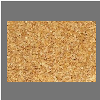
Healthy Dalia Wheat