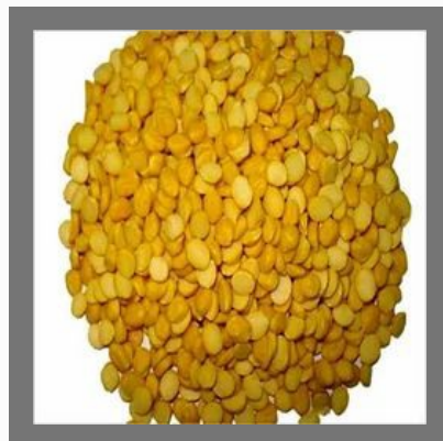
Polished Chana Dal