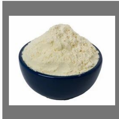
Besan Chick Peas Flour