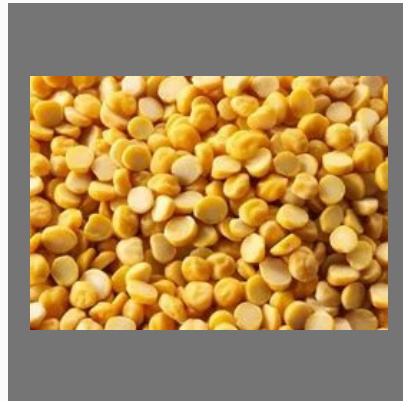
Fresh Chana Dal