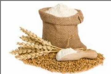
Pure Chakki Atta