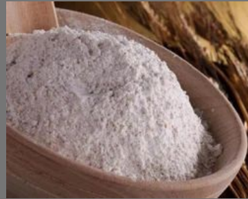
Shudh Chakki Atta