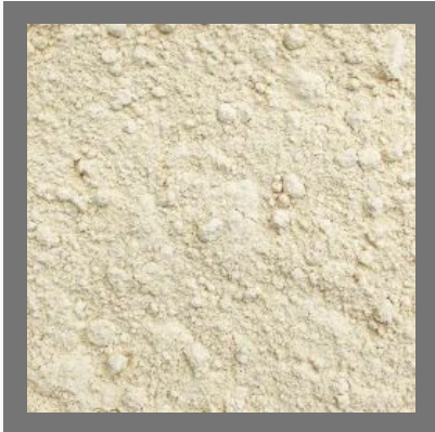
Chickpea Besan Flour