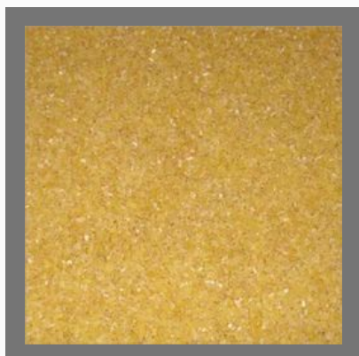
Broken Dalia Wheat