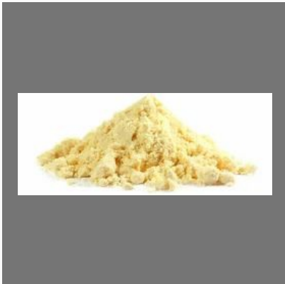
Gram Besan Flour