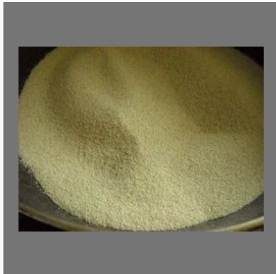
Fress Suji Flour