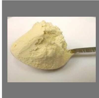
Fresh Besan Flour