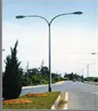
Steel Tubular Pole