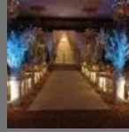
Theme Decorator Services