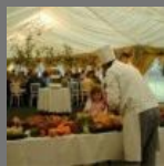
Catering/ Bartending Services