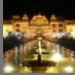
Venue Options Services