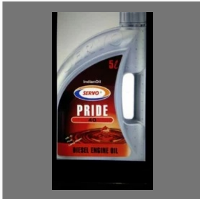
Servo Diesel Engine Oil