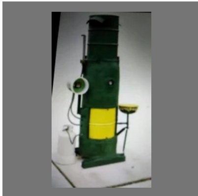
Boiler Fuel Oil