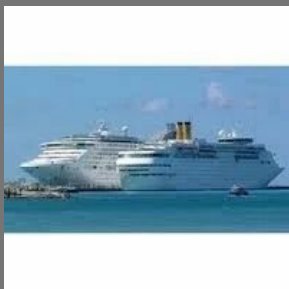
Trunk Piston Engine Oils