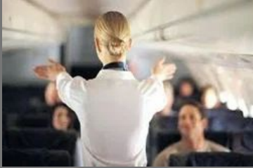
Cabin & Crew Supplies