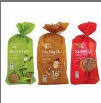
Bread & Baked Goods