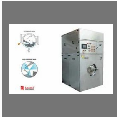
Automatic Bung Washing Machine (Rfs)