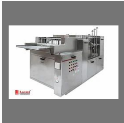
Automatic Vial Bottle Washing Machine