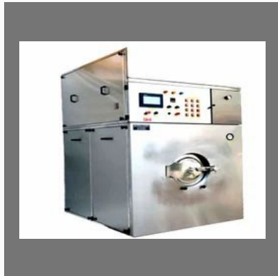
AUTOMATIC BUNG WASHING MACHINE