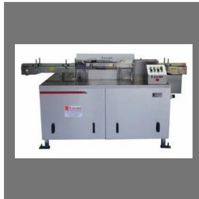
Automatic Air Jet Cleaning Washing Machine