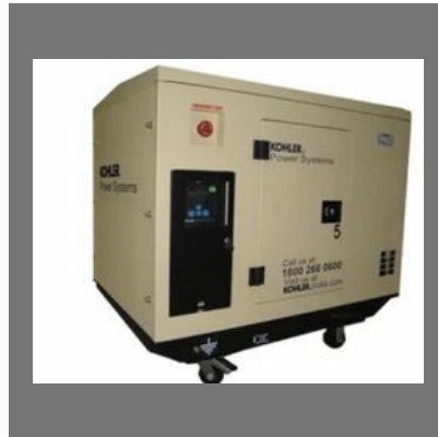
Kohler Domestic Diesel Generators