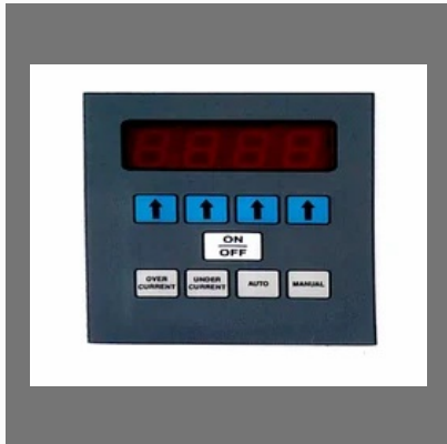
Automatic Water level controller