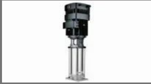
Grundfos Vertical Inline Pumps