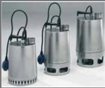
Submersible Drainage Pumps