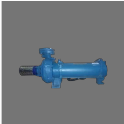
Openwell Submersible Pumps