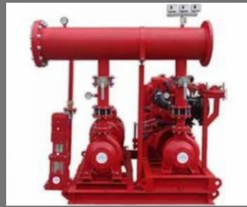
Fire Fighting Pumps