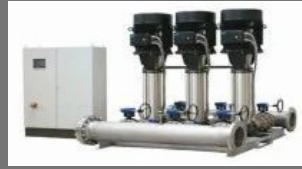
Grundfos Hydro Pneumatic Presses