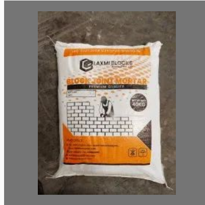
LAXMI Block Joint Mortar