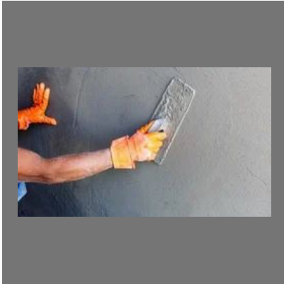
Ready Mix Plaster