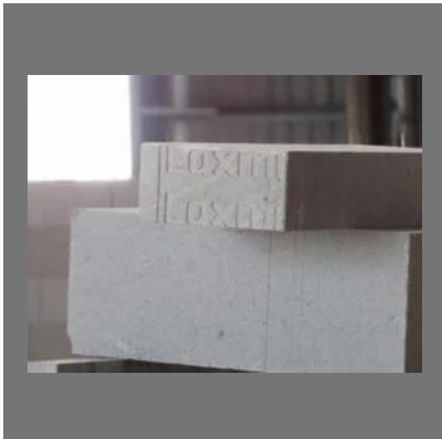
Lightweight Aac Block