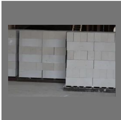
AAC Block for custruction