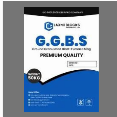
GGBS Ground Granulated Blast Furnace Slag