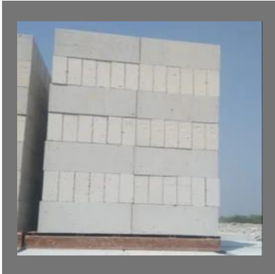
Aerocon Aac Blocks