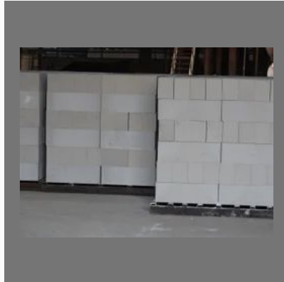
AAC Wall Block