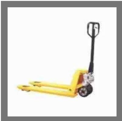
Hydraulic Pallet Truck