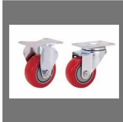
Medium Duty Casters