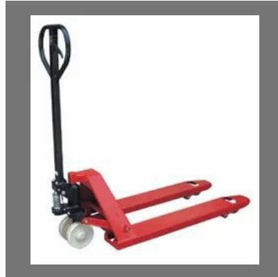
High Lift Pallet Truck