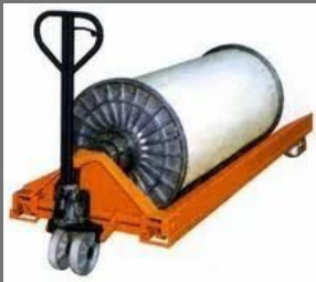
Textile Material Handling Equipment