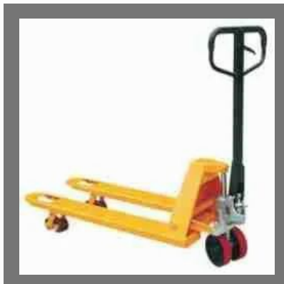
Hand Pallet Truck