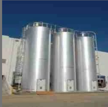
Bulk Handling Equipment