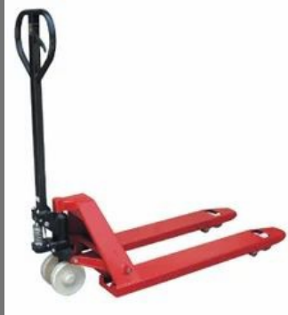
Drum Handling Equipment