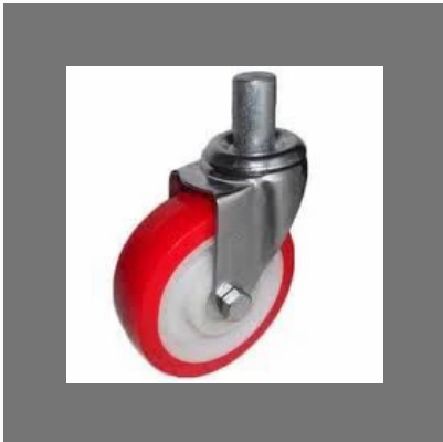
Light Duty Casters