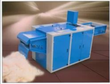
Roving Waste Opener Machine