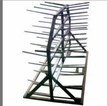
YCP Yarn Carrier Trolley S.S