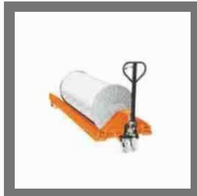
Hydraulic Beam Pallet Truck