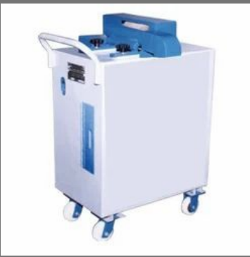
Roller Cleaner Machine