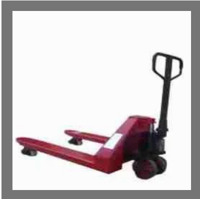
Hydraulic Hand Pallet Trucks