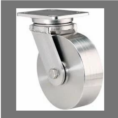
Stainless Steel Casters