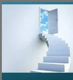
Advance Licensing Scheme/duty Exemption Entitlement Certificate