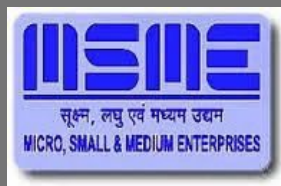
Market Development Assistance Scheme for Micro, Small & Medi