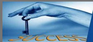
Nidhi Company (Mutual Benefit Society)