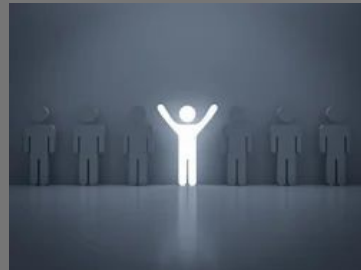
One Person Company (OPC)