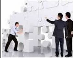
Focus Product Scheme(FPS)