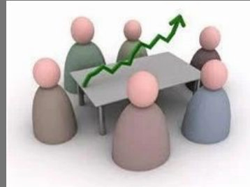
Focus Market Scheme(FMS)