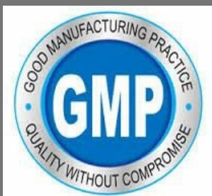
GMP compliance (Good Manufacturing Practices)