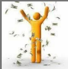
Served From India Scheme (SFIS)