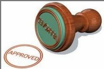
Shop and Establishment License (Gumasta License)