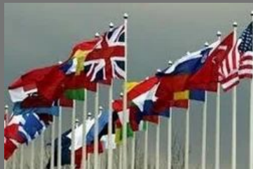
Foreign Company Registration