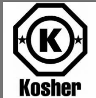
Kosher ISO Certification Consultancy