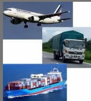
Export Promotion Of Capital Goods Scheme(EPCG)