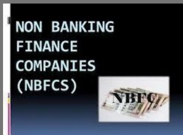
Non-Banking Financial Company (NBFC)