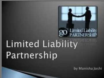
Limited Liability Partnership (LLP)