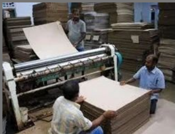
Subsidy Schemes of NSIC