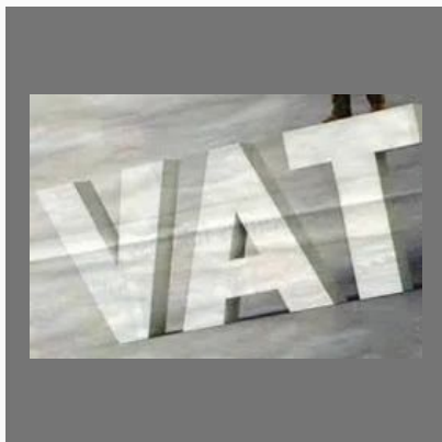
VAT Registration Services