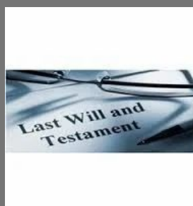
Will Drafting Services