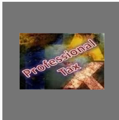
Profession Tax Registration