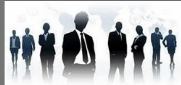
Overseas Recruiting Agent License: