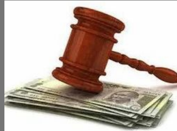
Payment Dues Recovery Assistance