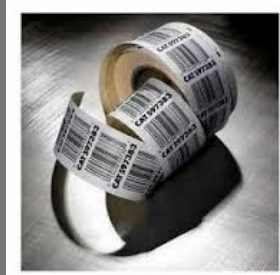
Financial Assistance On Bar Code