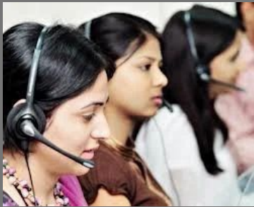
Service Provider (OSP) Licensing Services