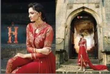
Heavy Georgette Anarkali Salwar Kameez