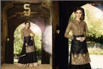
Designer Heavy Anarkali Salwar Suit