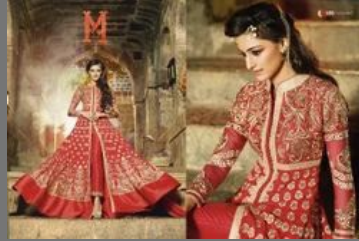
Designer Anarkali Salwar Suit