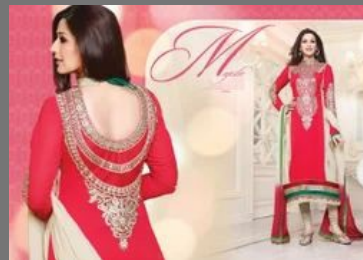
Royal Georgette Suit