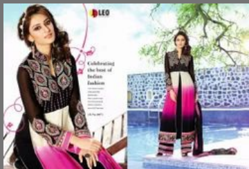
Designer Ladies Suit