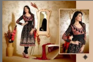
Partywear Churidar Suits