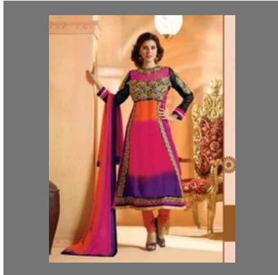
Straight Salwar Kameez