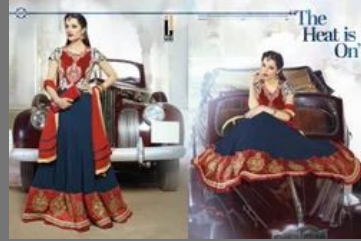
Wedding Wear Anarkali Suit