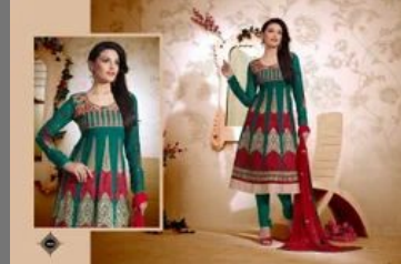
Georgette Churidar Suit