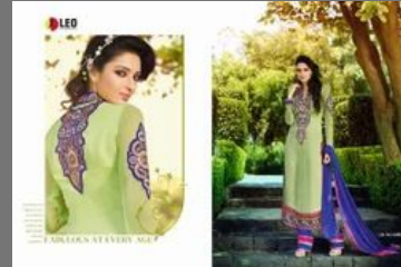
Straight Salwar Suit