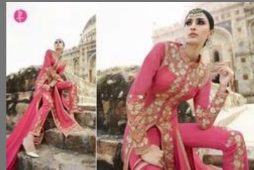
Designer Straight Suit