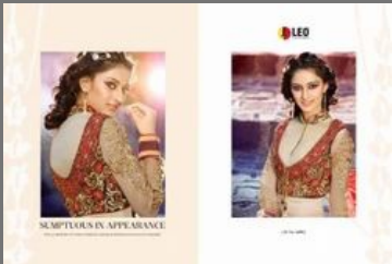
Latest Ladies Suit