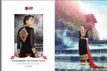
Designer Ladies Straight Suit