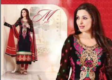
Royal Georgette Suit