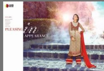
Exclusive Ladies Suit