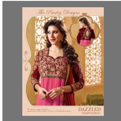
Georgette Salwar Kameez