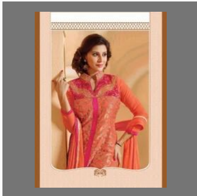
Latest Salwar Kameez