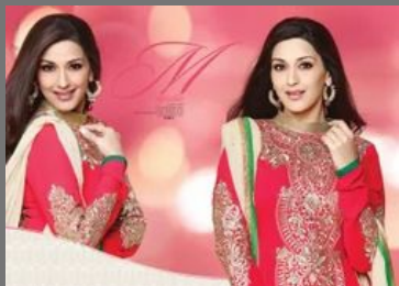
Royal Georgette Suit