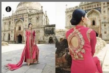
Designer Straight Suit