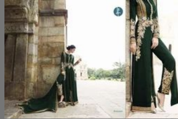
Embroidered Straight Suit