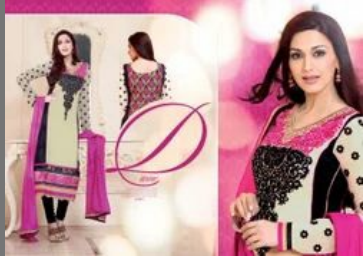
Royal Georgette Suit