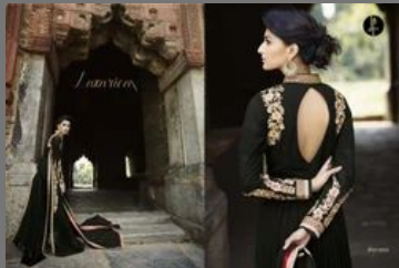
Designer Embroidered Suit