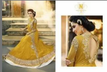
Anarkali Salwar Suit