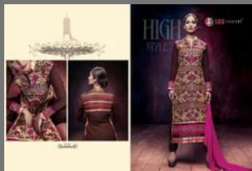
Straight Royal Georgette Suit