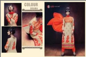
Royal Georgette Straight Suit