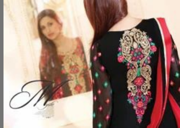
Royal Georgette Suits