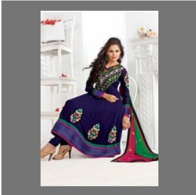
Party Wear Suits