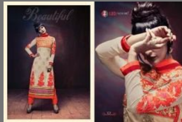
Royal Georgette Straight Suit