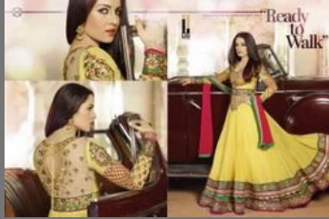
Exclusive Embroidery Suit