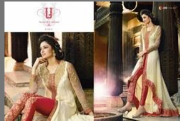
Heavy Embroidery Anarkali Salwar Suit