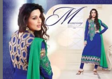
Royal Georgette Straight Suits