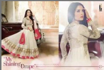
Embroidery Anarkali Suits