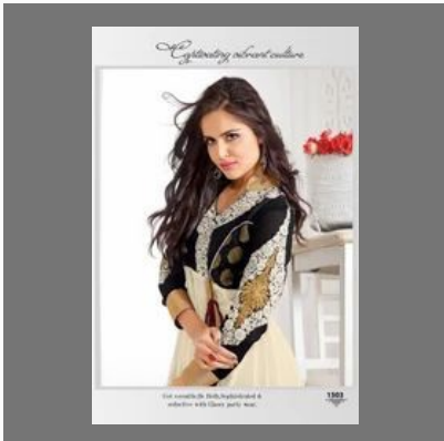
Straight Party Wear Suits