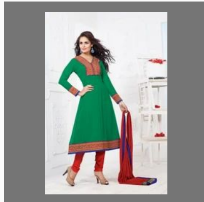
New Party Wear Suits