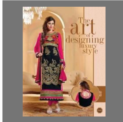
Straight Georgette Suit