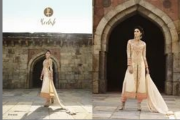
Straight Designer Suit