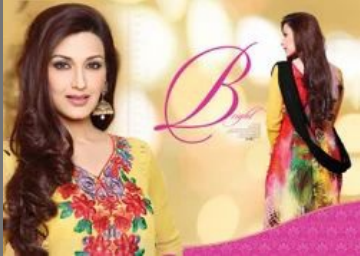
Royal Georgette Suit