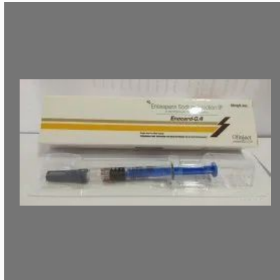
Enoxaparin Sodium Injection 40 Mg