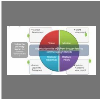
Growth Advisory Consulting