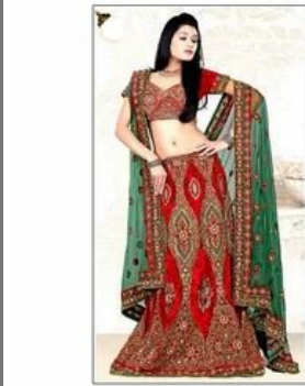
Bridal Wear Lehenga