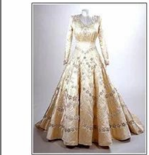
Bridal Gown- Royal Look