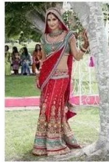
Wedding Designer Lehnga Cholis