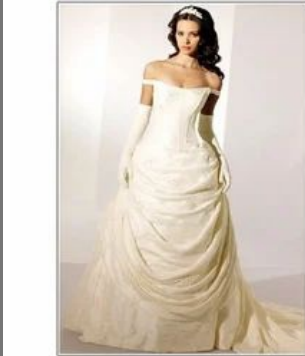
Bridal Gown- White Base