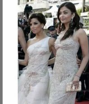
Embroidered Bridal Gown