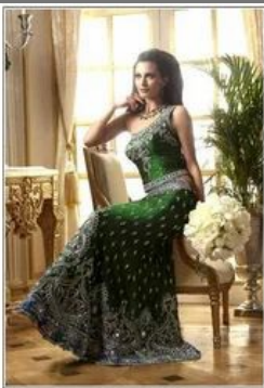
Embroidered Wedding Dress