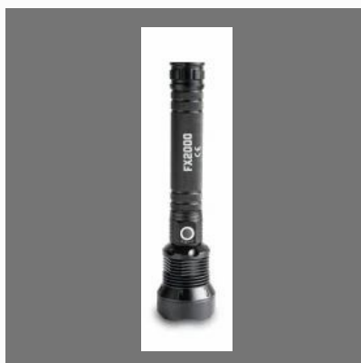
Unirol LED Tactical Heavy Duty Tactical Flashlight FX2000