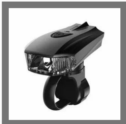
Uniroy VM3 Smart Bicycle Light 350 Lumens