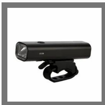
Uniroy VM7 Bicycle Front Light 400 Lumens USB Rechargeable Water Resistant