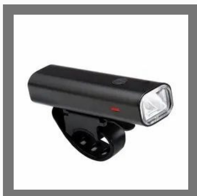
Uniroy VM7 Smart Front Bicycle Light