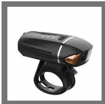
Uniroy VM4 Premium Bicycle Light 350 Lumens