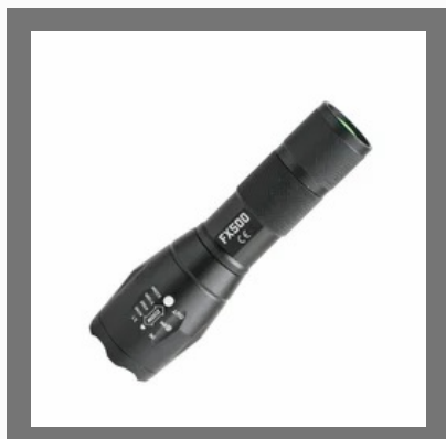
Unirol LED Tactical Flashlight FX500