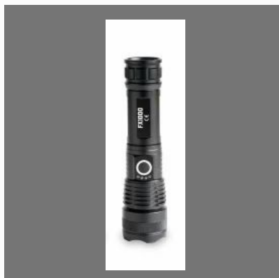
Unirol High Power LED flashlight FX1000