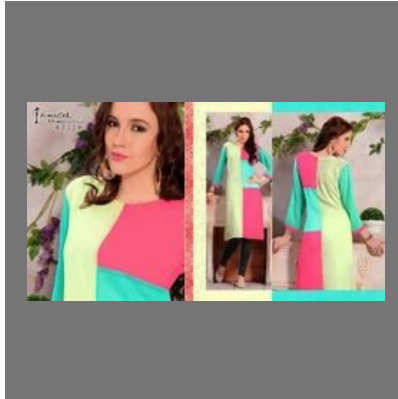
Cotton Simply Dress