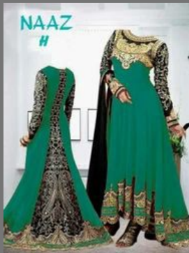
Trendy Exclusive Suit