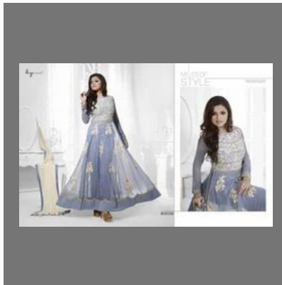
Bollywood Anarkali Printed Fancy Work Dress