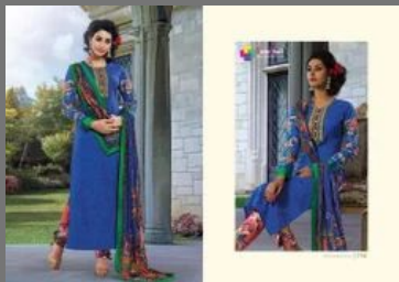
Exclusive Fancy Suit