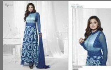
Traditional Fancy Suit