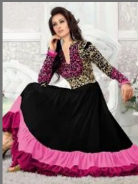
Fancy Anarkali Suit