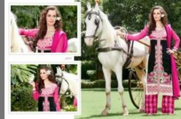
Cotton Embroidered Suits