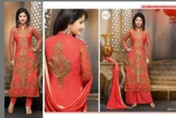
Plazzo Ladies Suit