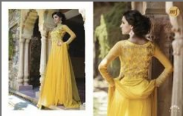
Trendy Designer Gown