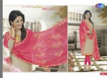
Cotton Suit Heavy Dupatta