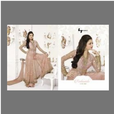
Gorogette Top Heavy Anarkali Suits