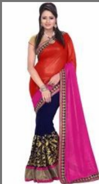
Chiffon Printed Work Saree