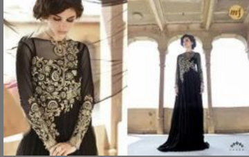
Net Ladies Suit