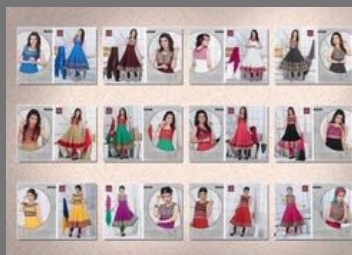
New Anarkali Printed Dress