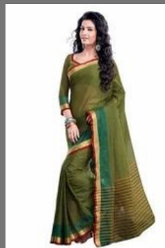
Designer Cotton Sarees