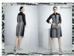
US Fashion Dress