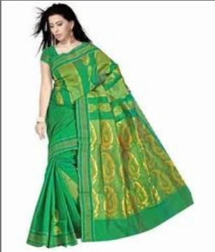
Fancy Silk Sarees