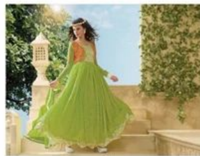
Stylish Anarkali Suit