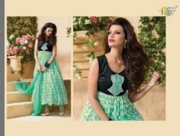
Catalog Dress Material