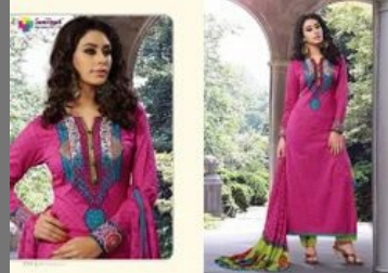
Latest Fancy Suit