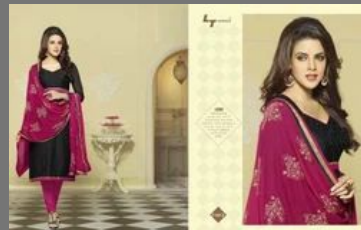
Chanderi Ladies Suit