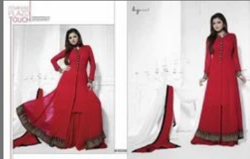
Designer Dress Material