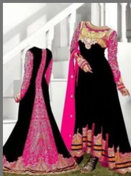
Latest Exclusive Suit