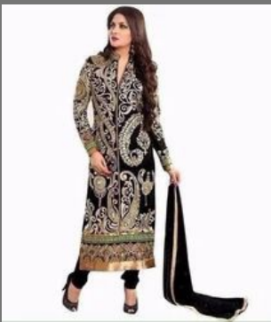
Bollywood Designer Work Suit