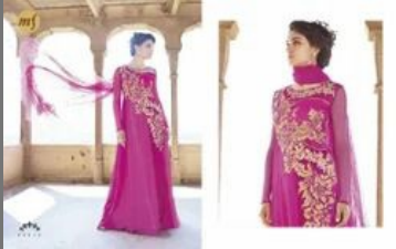
Exclusive Designer Gown