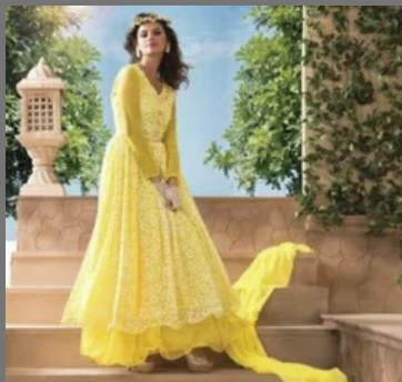
Trendy Anarkali Suit