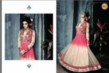
Beautiful Anarkali Suits