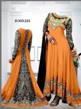
Stylish Exclusive Suit