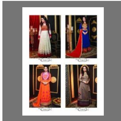
Heavy Work Anarkali Suit