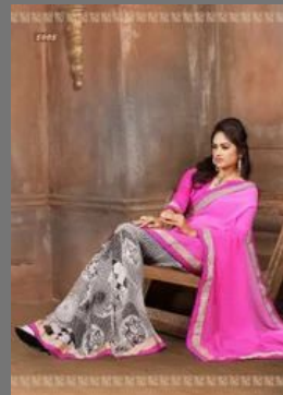
Designer Printed Saree