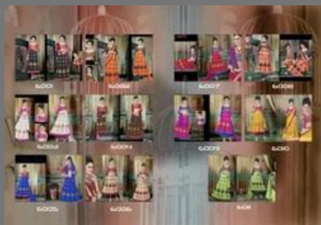
Anarkali Heavy Work Dress Material