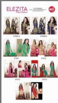
Designer Embroidered Palazzo Suits