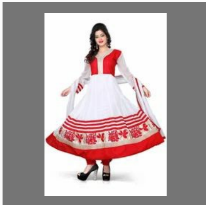
Indian Style Printed Anarkali Dress