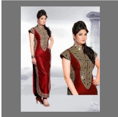
New Bollywood Style Party Wear