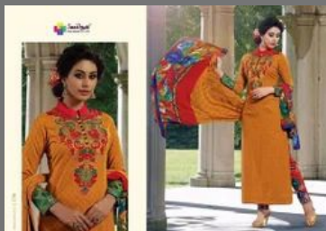
Trendy Fancy Suit