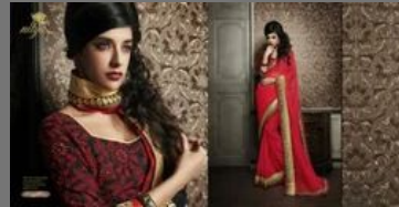
Designer Georgette Saree