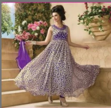
Latest Anarkali Suit