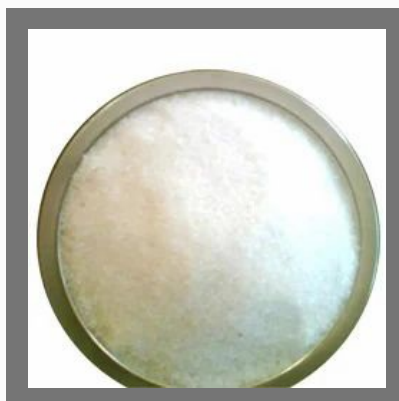
Silica Gel For Column Chromatography