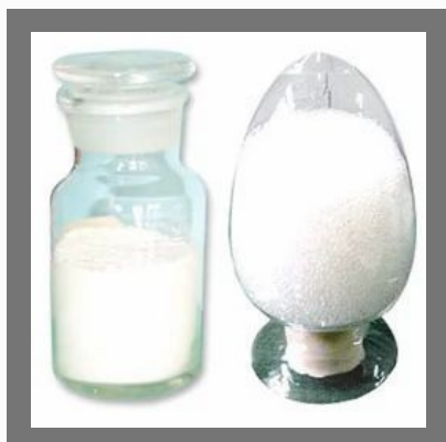
Silica Gel For Thin Layer Chromatography