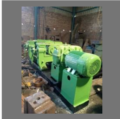
Used Rubber Mixing Mill unidrive Machine, 50 hp