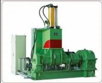
55 Litres Rubber Dispersion Kneader Machine