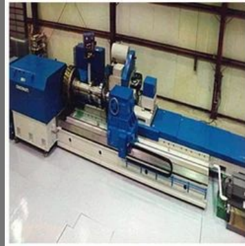
Second Hand Roll Grinder Machine