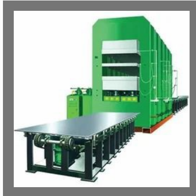
Used Rubber Hydraulic Press