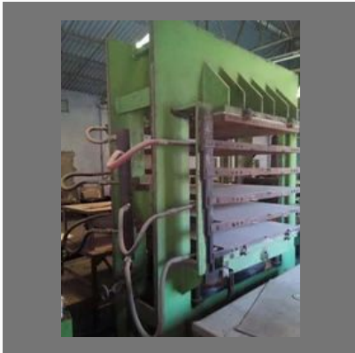
Second Hand Eva Sheet Hydraulic Press