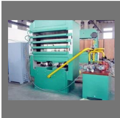
Second Hand Rubber Hydraulic Press