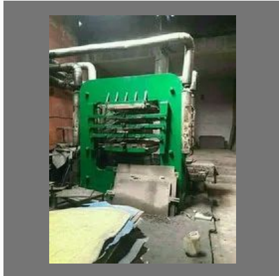
Used Rubber Hydraulic Press