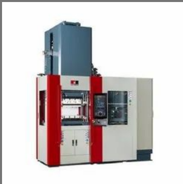
100 Tons Vertical Rubber Injection Moulding Machine