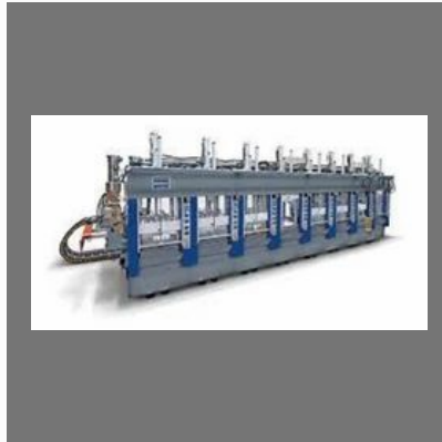
Second Hand EVA Injection Moulding Machine For Footwear