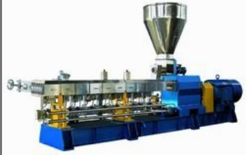
Second Hand Twin Screw Machine For Compounding