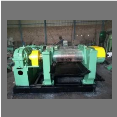
Second Hand Rubber Mixing Mill Machine