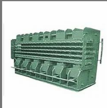
Second Hand Precured Hydraulic Press