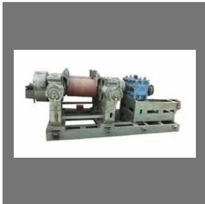
250-350 kg/hr Used Rubber Refiner Mill, 100 HP