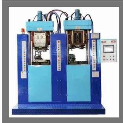
2nd Hand Footwear Sole Making Machine