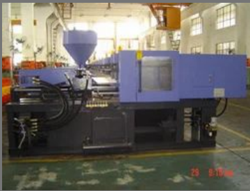
Second Hand Plastic Injection Molding Machine