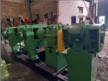
16x42 Rubber Mixing Mill