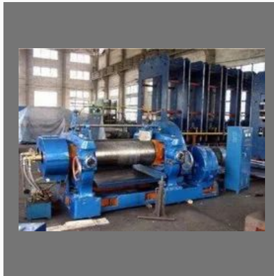
150-180 kg/hr Rubber Refiner Mill, 75 HP