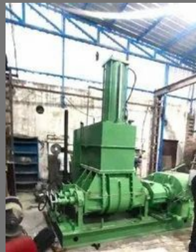
75 Litres Rubber Dispersion Kneader Machine