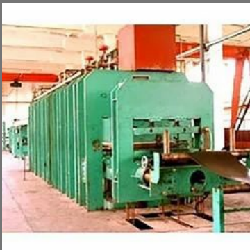
Second Hand Conveyor Belt Hydraulic Press