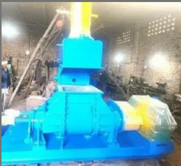
125 Litres Rubber Dispersion Kneader Machine