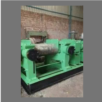
Rubber Mixing Mill, 60 HP