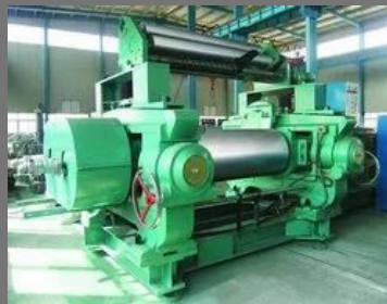
Second Hand Two Roll Mill