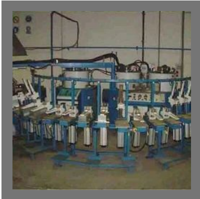
Second Hand PU Sole Making Machine