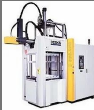
250 Tons Rubber Injection Moulding Machine, 1500 Kg/cm 2