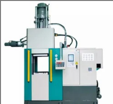
200 Tons Vertical Rubber Injection Moulding Machine