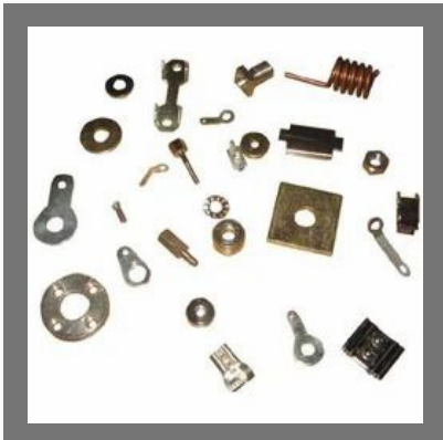
Sheet Metal Pressed Components