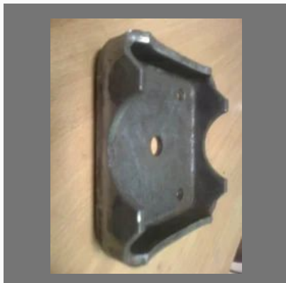
5 Mm Clamp