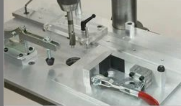
Industrial Jigs and Fixtures