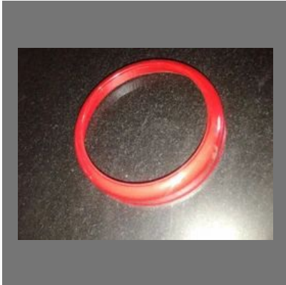
Sheet Metal Pressing Parts