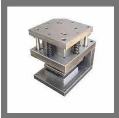
Press Tool Die