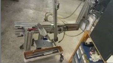
Steel Welding Jig