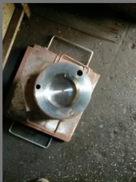
Industrial Machinery Parts