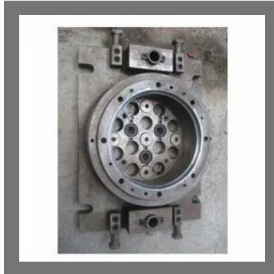
Precision Press Tool