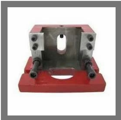
Pipe Notching Tools