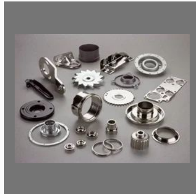
Precision Sheet Metal Components