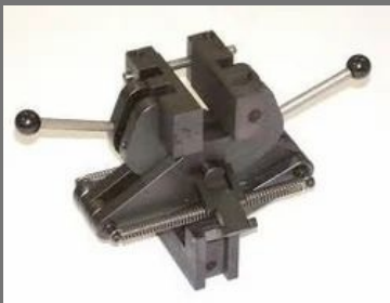
Jig and Fixture Tool