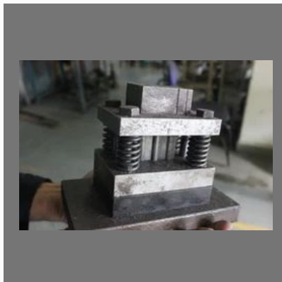
Dies Press Tool