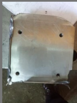
Mild Steel Block