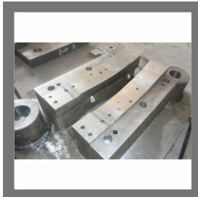
Industrial Press Tool Dies