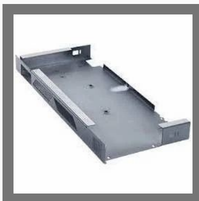
Sheet Metal Prototype