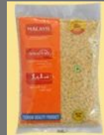
Masoor Dhall Red