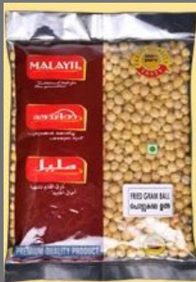
Fried Gram Ball