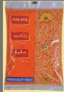
Masoor Dhal Red