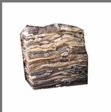
Raw Leather Skin