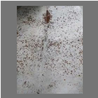
Hair On Leather