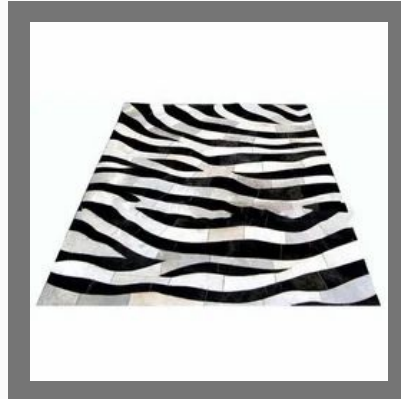
Zebra Design Leather Hairon