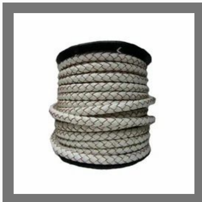
Leather Braided Cord