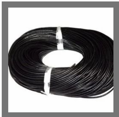
Leather Dyed Cord