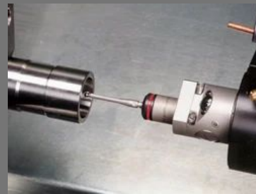
Lathes & Turning Centers Machine