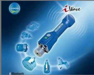
I-wave Manual Wireless Interface Device