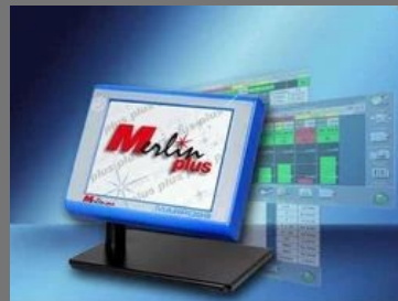
Merlin Plus Windows Embedded Gauge Computer