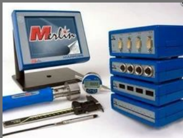
Merlin Embedded Gauge Computer