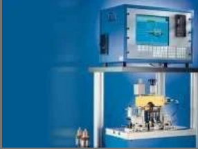
Electric Motor Armature Inspection System