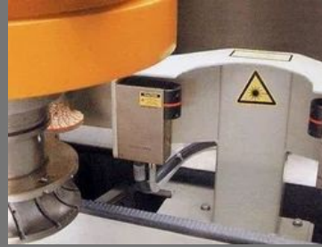
Mida Laser Tool Setting Application