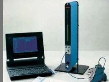
Software For Programming And Data Collection For E4n