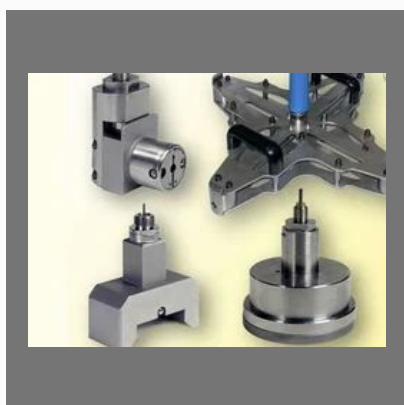
Special Manual Bore Gauges