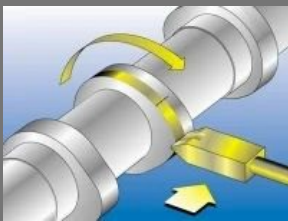
Material Integrity Test N. D. Camshaft Inspection Machine Tools