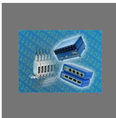
Data Acquisition Systems Machine Tools