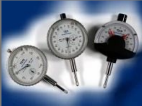
Indicators & Display Units Td - Dial Indicators Line Machine