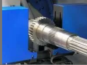
Optoelectronic Gauging Service