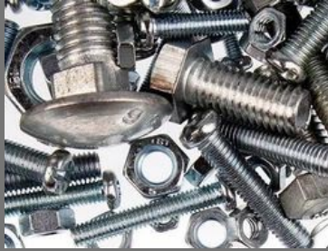
Massive Forming Machines Tools