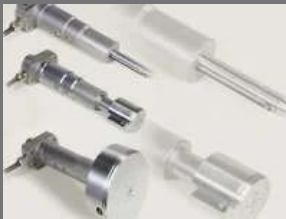
Measuring Plug For One Diameter