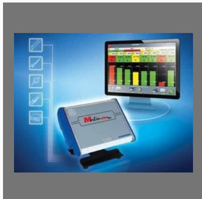
Merlin Plus Box Windows Black Box Gauge Embedded Computer