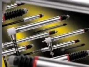
Probes & Measurement Transmission Systems Red Crown Machine