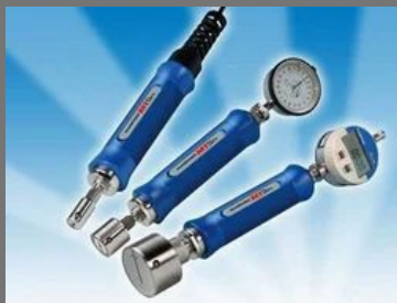
M1 Star Mbg Manual Mechanical Bore Gauge