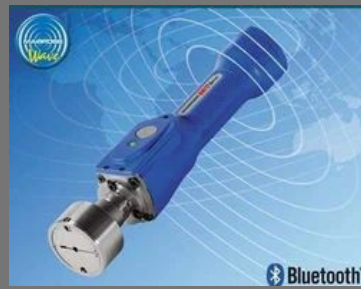
M1 Wave Manual Wireless Bore Gauge