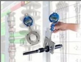
Od Snap & Ring Gauges Machine Tools