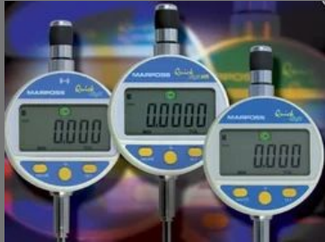
Digital Dial Indicators