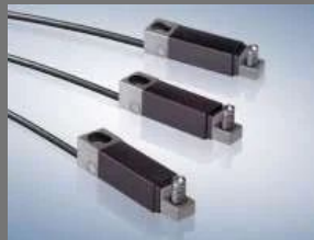
Lvdt Hbt Measuring Cells