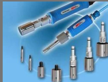
M1 Air Manual Air Bore Gauge