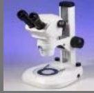
Advanced Stereo Microscopes