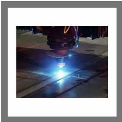
Laser Welding Services