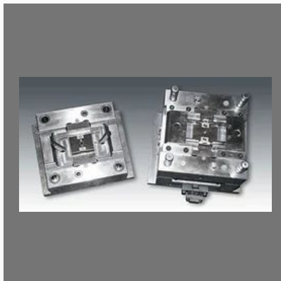
Aluminium Moulding Tool