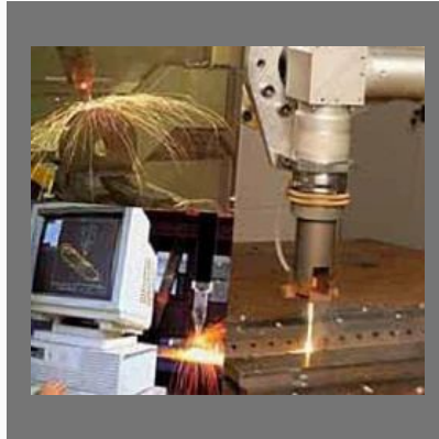
Laser Welding Works