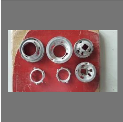
Zinc Casting Die Tool