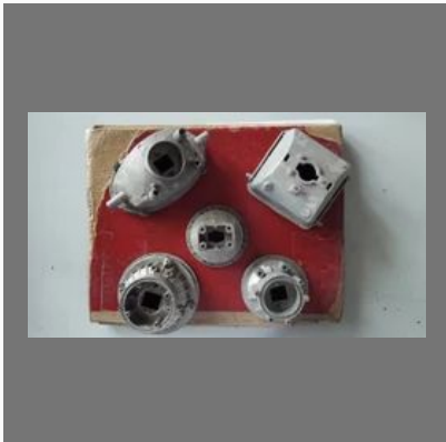
Aluminium Die Casting Tools