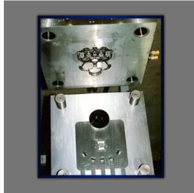
Zinc Die Casting Tools