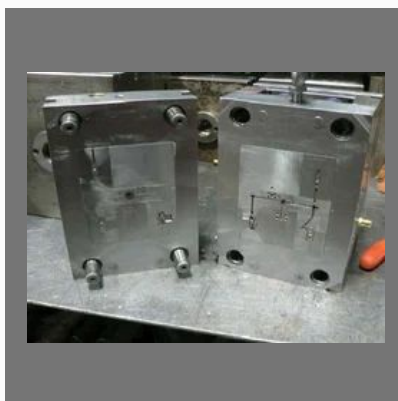
Injection Plastic Moulding Tool