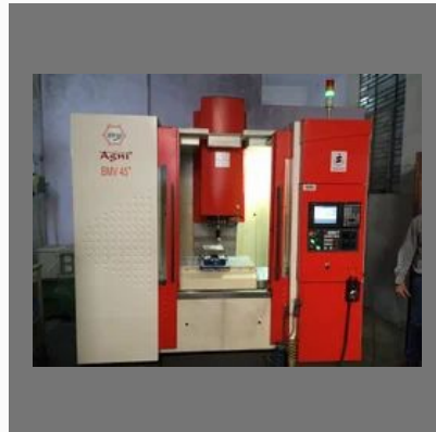
CNC Milling Machine Job Work