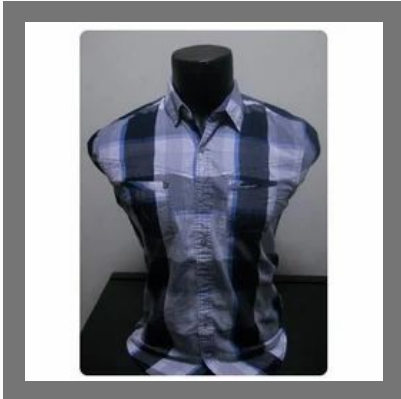
Designer Mens Shirts