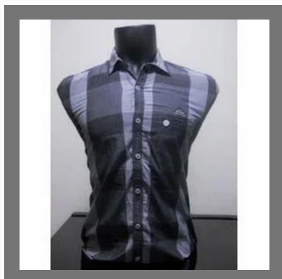
Light Colour Shirt