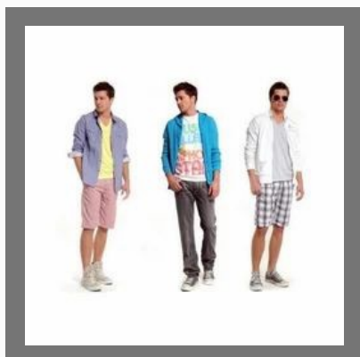
Mens Casual Wear