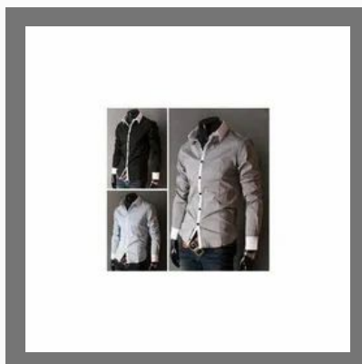
Mens Collar T-Shirts