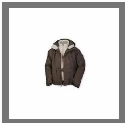
Mens Winter Jacket