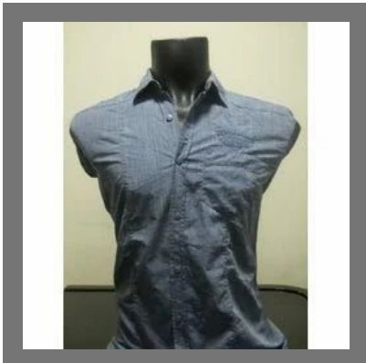
Mens Casual Shirts