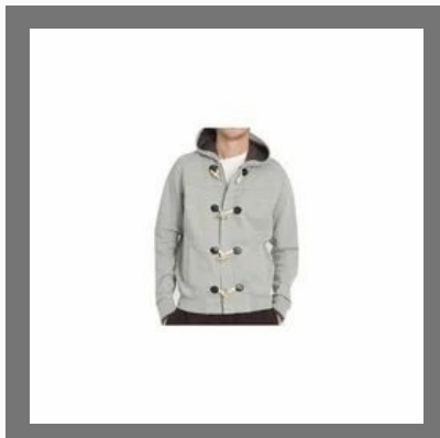
Cotton Drill Jacket