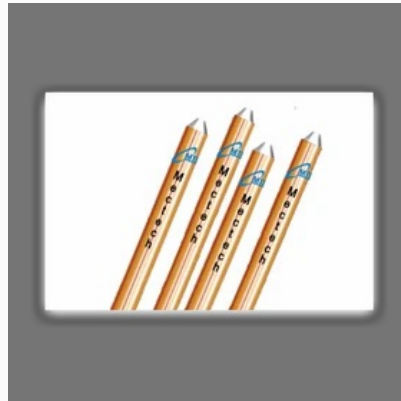
Mectech Copper Bonded Earthing Electrode