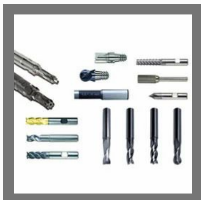
Solid Carbide Milling Cutter