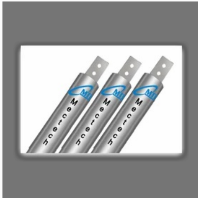
Mectech G I Earthing Electrode