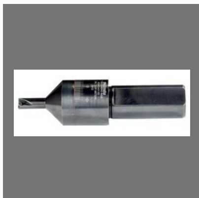
Fine Boring Bar