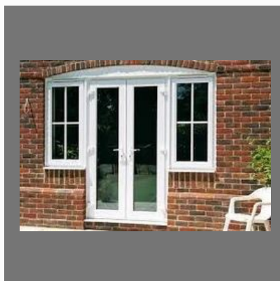
UPVC Door Windows