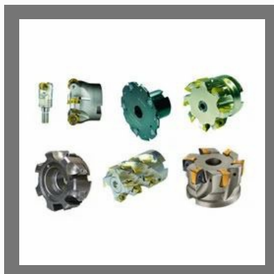
Milling Tools Indexable Insert