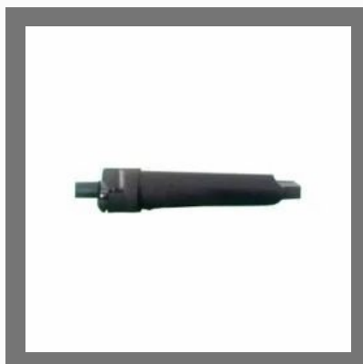
Spot Face Cutter