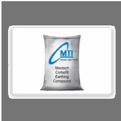
Carbofill Earthing Compound