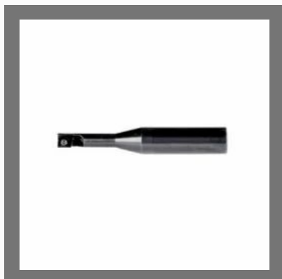
End Mill Cutter