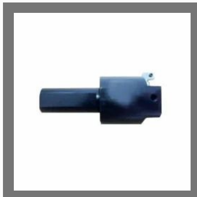
Finish Boring Bar