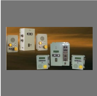
Vigilance Control Device