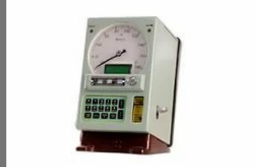
Speed Recorder MRT 921