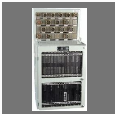
Control & Fault Diagnostic System