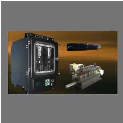
Common Rail Direct Injection