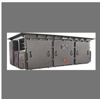
2.5kVA - 50kVA Inverters