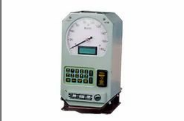
Speed Recorder MRT 922