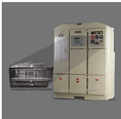
Locomotive Control Computer