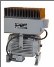
Auxiliary Inverter Motors