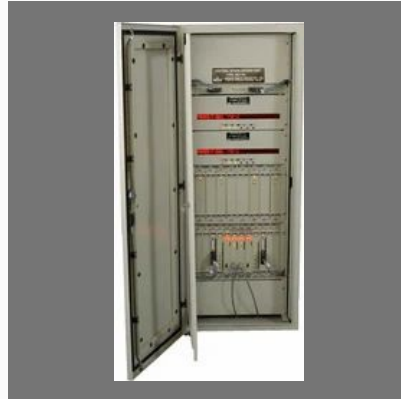
Electronic Interlocking System