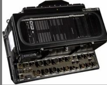
Locomotive Control System