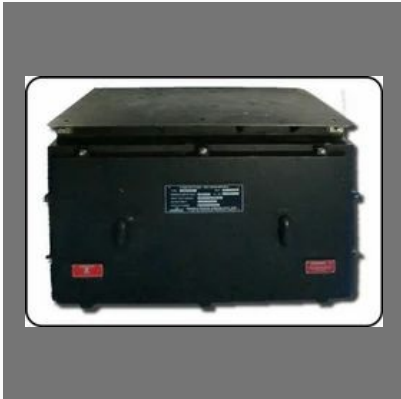
5 KW DC-DC Converter