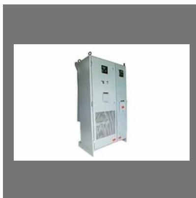
Inverter MIN 253