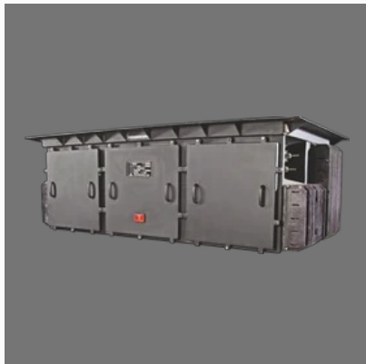
50 kVA Auxiliary Converter