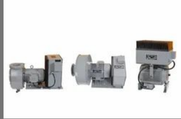
Auxiliary Inverter Motors