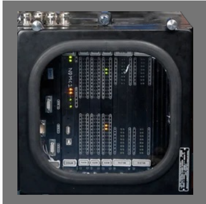
Train Information and Management System (TIMS)