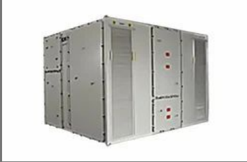
Traction Converter Information