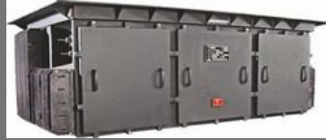
2.5kVA - 50kVA Inverters