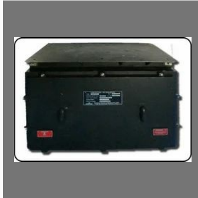
5 kW DC-DC Converter