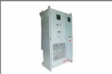
Inverter MIN 253