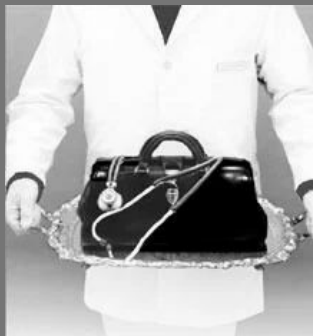
Health Care Network