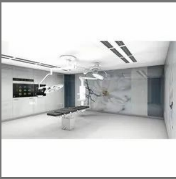
Prefabricated Modular Operation Theater