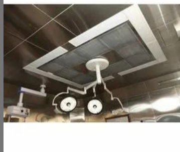
Surgical Ceiling Light