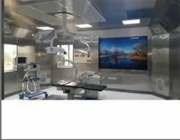
Modular Operation Theater