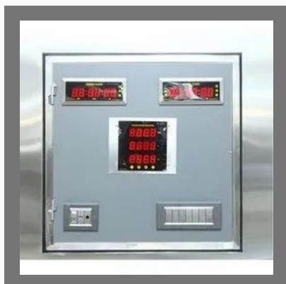
Digital Display Operation Theatre Control Panel