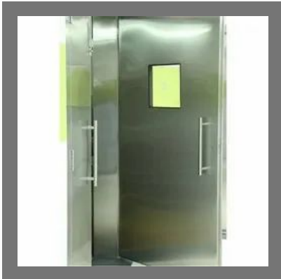
Stainless Steel Hospital Door