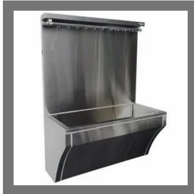
Surgical Scrub Sink