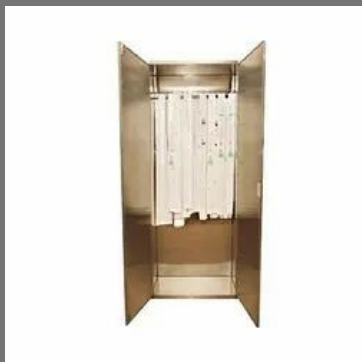
Catheter Storage Cupboard