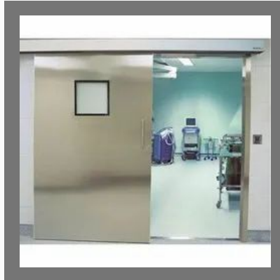
SS Hermetically Sealed Sliding Door