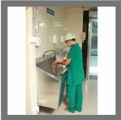
Operating Room Scrub Sink