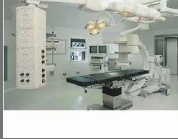
Steel Modular Operation Theater