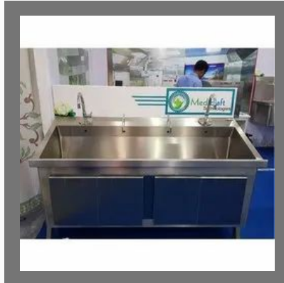
Surgical Scrub Sink