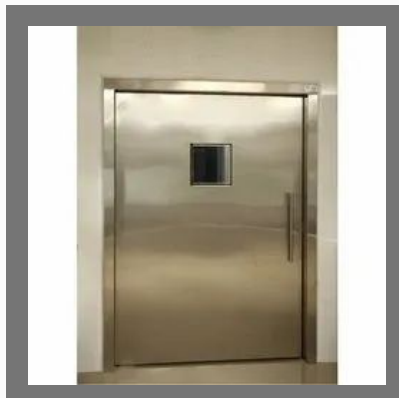
Stainless Steel OT Door