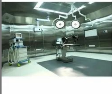
LED Surgical Ceiling OT Light