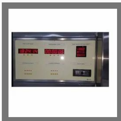
Surgeons Control Panel