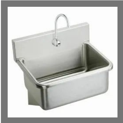
Surgical Scrub Sink