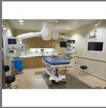
FRP Prefabricated Operation Theater