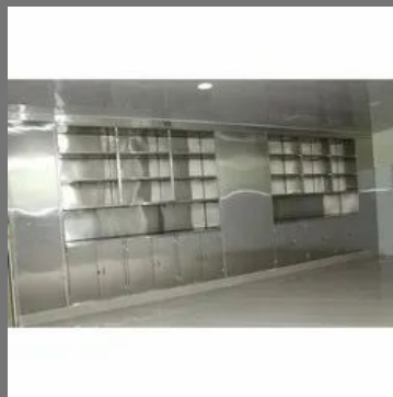
Stainless Steel Sterile storage cupboards