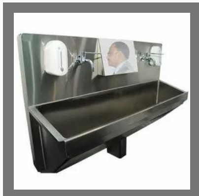
Surgical Scrub Sink