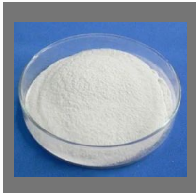
Sodium Meta Bi Sulphate (SMBS)