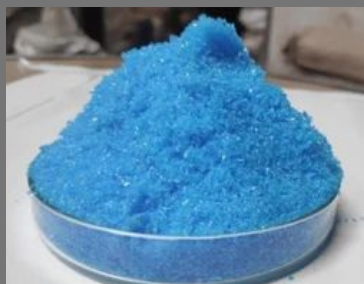
Copper Sulfate Powder