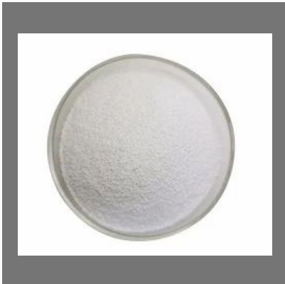
Sucralose Sweetener Powder