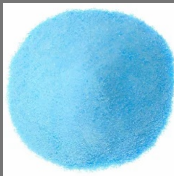
Copper Sulfate Powder For Agriculture