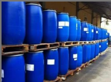
Sodium Lauryl Ether Sulfate (sles)