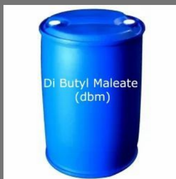
Di Butyl Maleate (dbm)