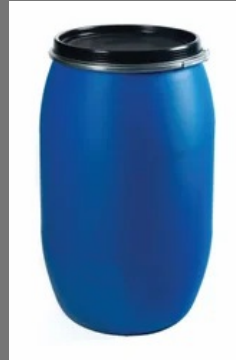
Poly Ethylene Glycol -4000 (P.E.G)