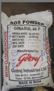
Alpha Olefin Sulfonate Powder- (A.O.S.)