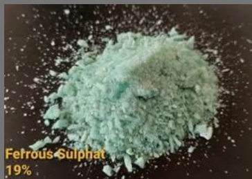
Ferrous Sulphate heptahydrate Powder