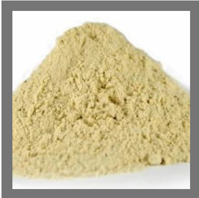
Wheat Gluten Powder