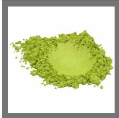
Apple Green Powder