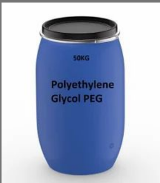
Poly Ethylene Glycol ( P.E.G) 6000