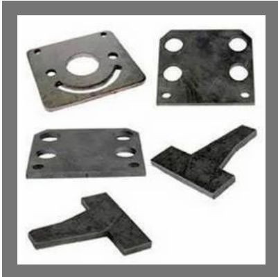
Sheet Metal Cutting Services