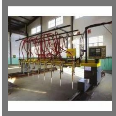
CNC Gas Cutting Services