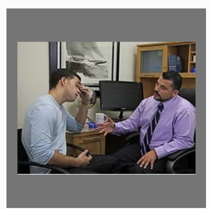
Drug Addictions Treatment