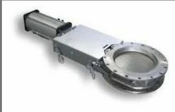
Pneumatic Slide Gate Valves