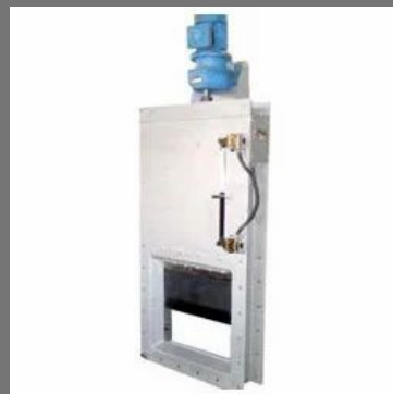
Motorized Slide Gate Valve