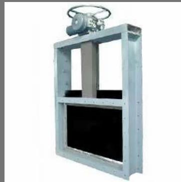
Slide Gate Valves