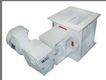
Economical Drop Thru Valve