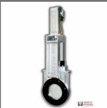
Knife Gate Valves