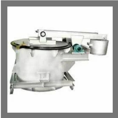
Coffee Pot Damper