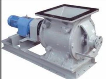
Industrial Rotary Valves