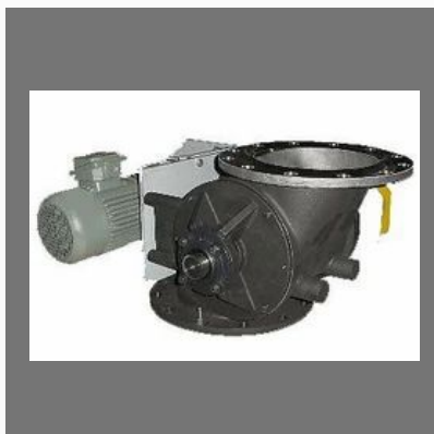
Side Entry Discharge Valve