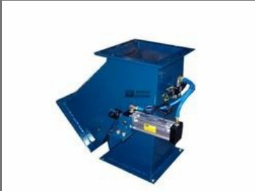
Two Way Gravity Diverter Valves