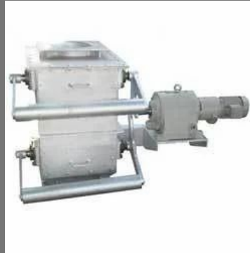
Double Cone Valves