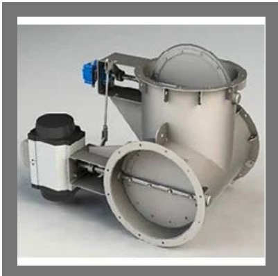
Three Way Divertterter Damper