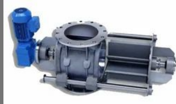
Quick Clean Rotary Valves