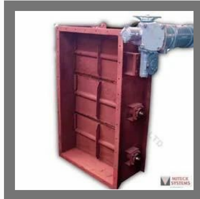
Multi Louver Dampers