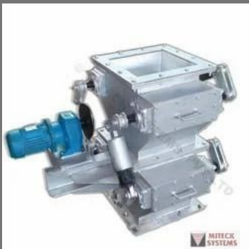
Double Flap Valves