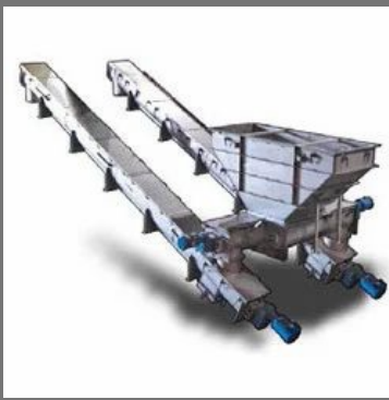
Inclined Screw Conveyor