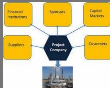
Project Financing Arrangement Services