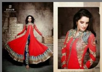
Ladies Anarkali Suit And Saree