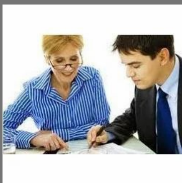
NRI Assistance Services