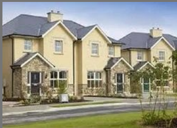
Sales of Residential Property Services