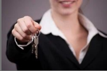
Commercial Property Services