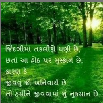
Agriculture Land Sale