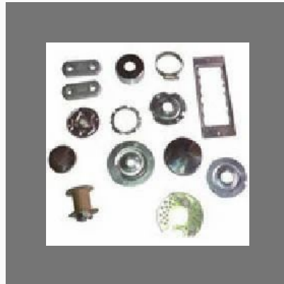
Engineering Parts - Wear Strip