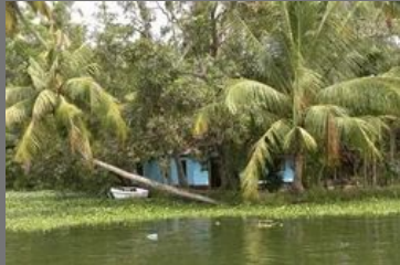
Coconut Backwater Plot Services