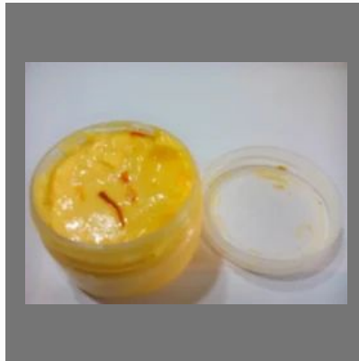
Saffron Day Cream