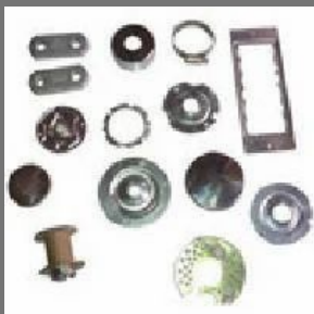
Engineering Parts - Wear Strip