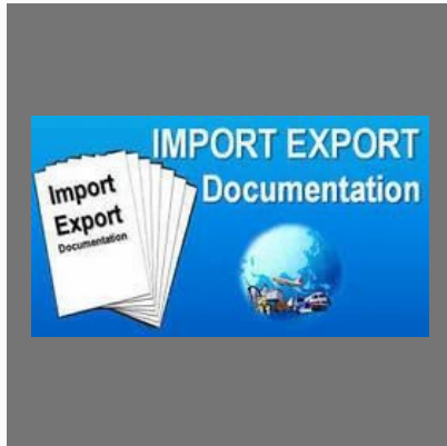
Import and Export Documentation