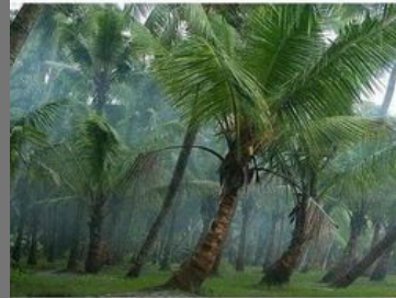
Coconut Land for Farm