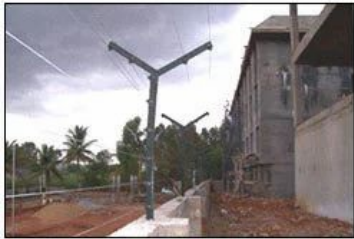
Solar Electric Fence