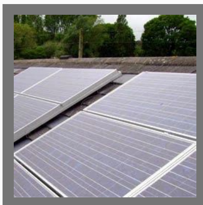
Power Solar Photovoltaic Systems