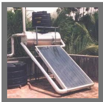
Solar Water Heater