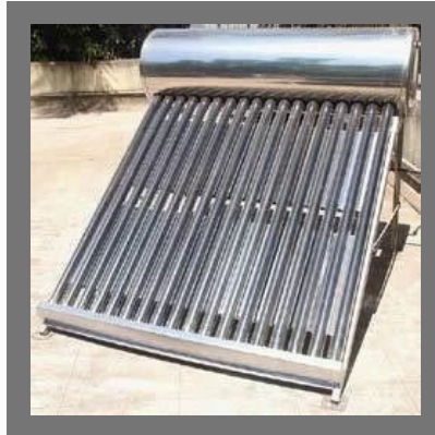
ETC Solar Water Heater