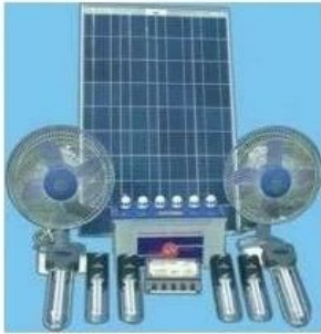
Solar Home Light System