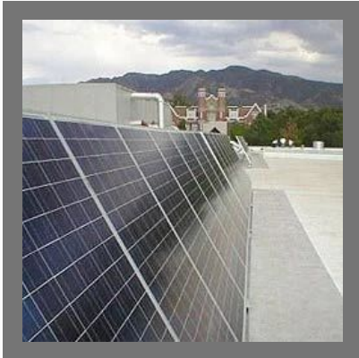
Solar Power Generating System