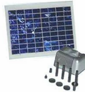
Solar Water Pump