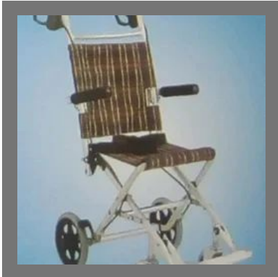
Electric Stair Climbing Wheelchair