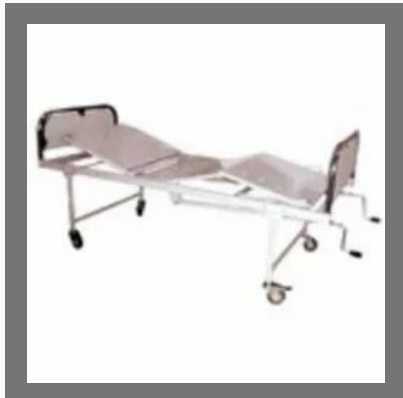
Hospital Fowler Bed (STD)