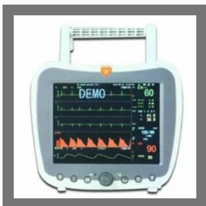
Multi Parameter Patient Monitor (Superview 8.4 inches)