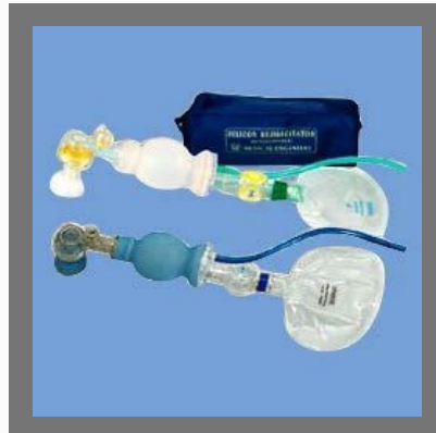
Infant Silicon Resuscitators