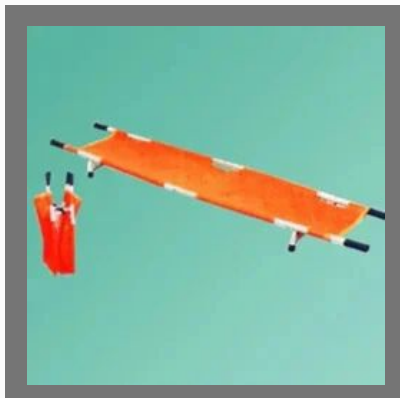
Double Fold Stretcher