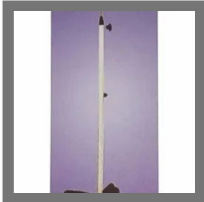
Hospital I V Stand