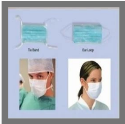
3 Ply Face Mask