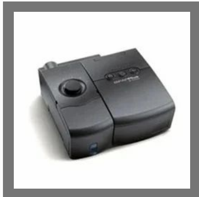
Res Plus Bipap