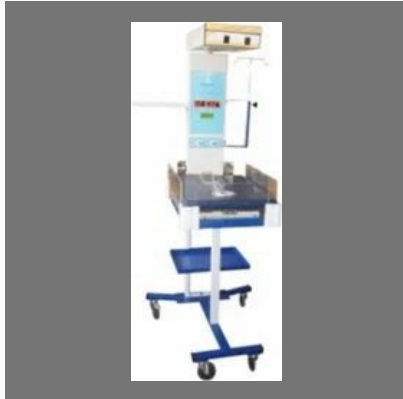
Infant Radiant Warmer