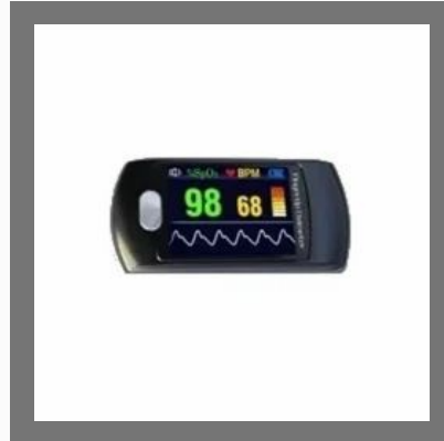
Fingertip Pulse Oximeter