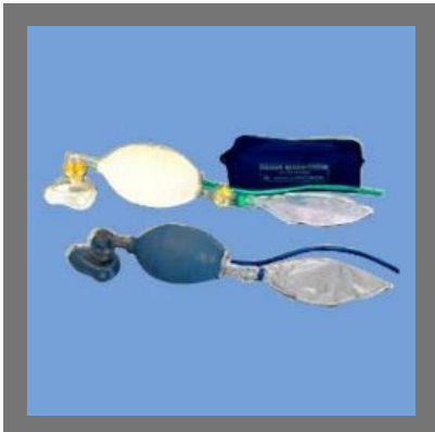
Adult Silicon Resuscitators