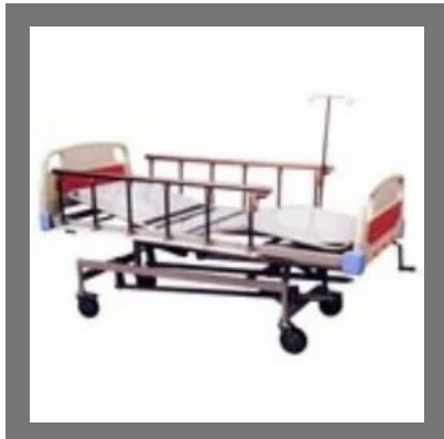
ICU Beds Mechanical (ABS Panels)