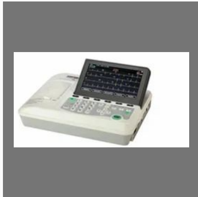
12 Channel Ecg Machine