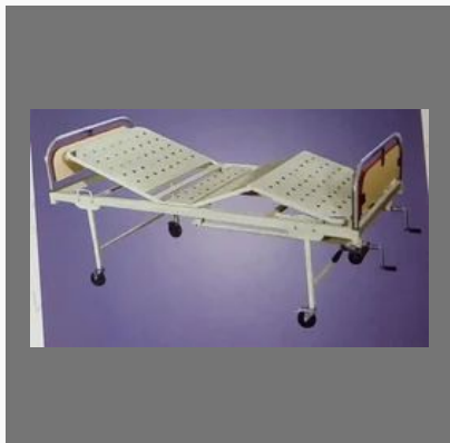
Hospital Flower Bed (SS Bows Deluxe)