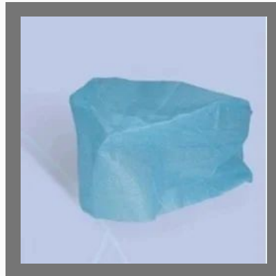
Disposable Surgeon Cap