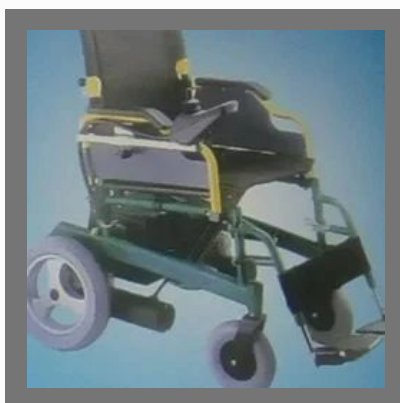
Black Wheel Chair