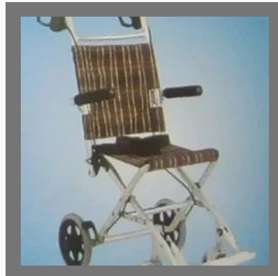
Electric Wheel chair