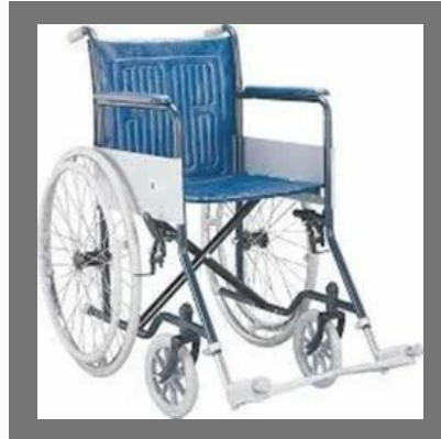
Blue Wheel Chair