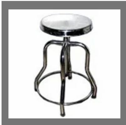
Hospital Visitor Stools