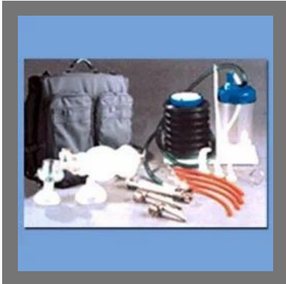
Emergency Resuscitation Kit