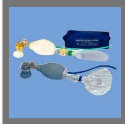
Child Silicon Resuscitators