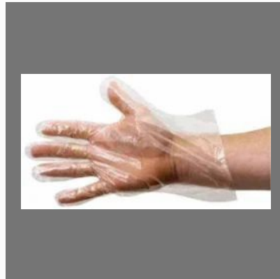
Disposable Plastic Gloves