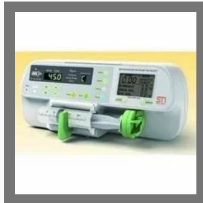
Syringe Infusion Pump