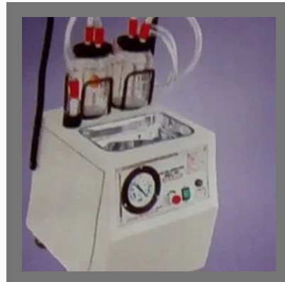
Electric Suction Apparatus