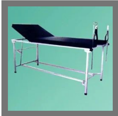
Examination Table And Bed