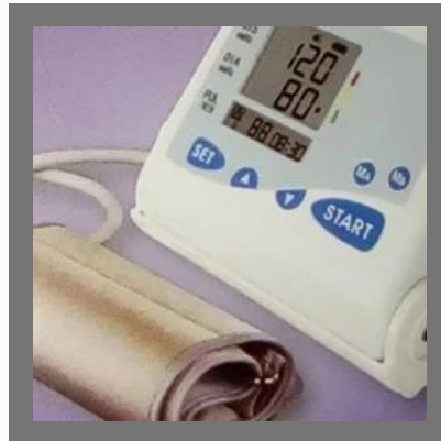
Digital BP Monitor