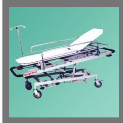
Emergency Recovery Trolley