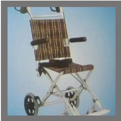
Electric Wheel chair