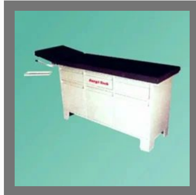
Hospital Examination Couch