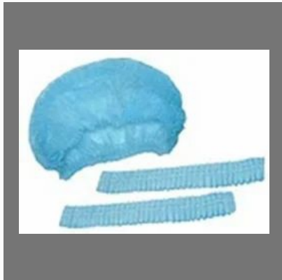
Disposable Bouffant caps