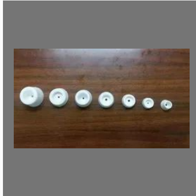
Nylon Door Buffers