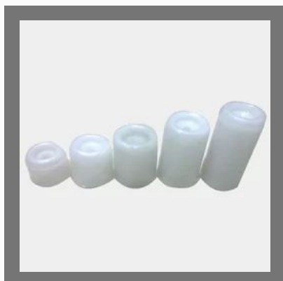
Nylon Door Silencers