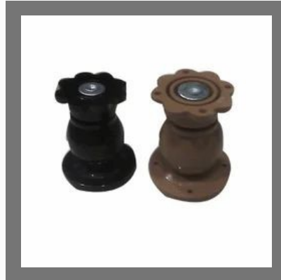
Magnetic Door Holders