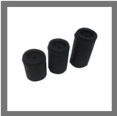
Rubber Door Silencers