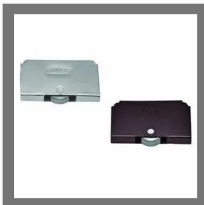
Glass Runner Teak