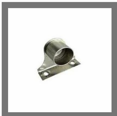
Pipe Bracket Bend