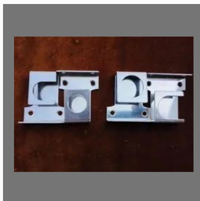
Universal Pipe Bracket State