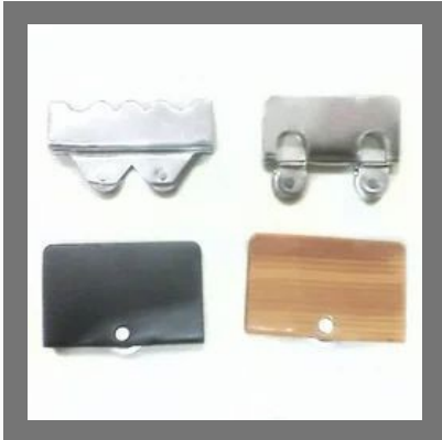
Door Glass Runners