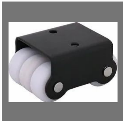
Four Wheel Fix Caster