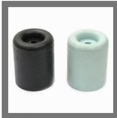
Rubber Door Stoppers