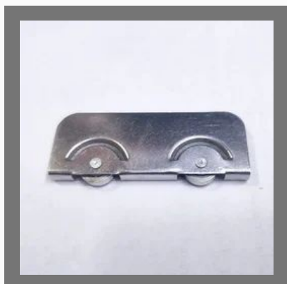
SS Double Glass Runner