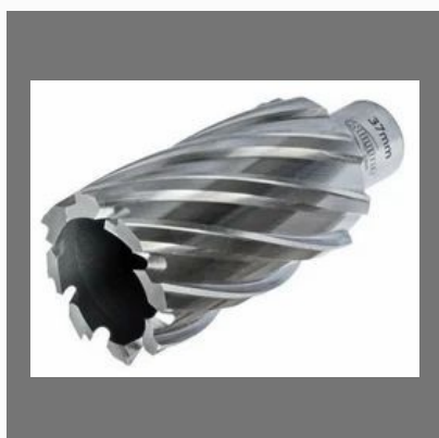
Broach Cutter TCT