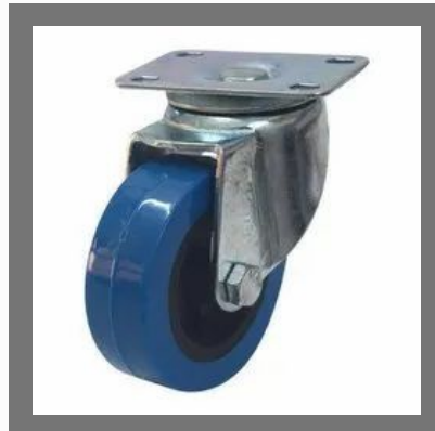
Single Wheel Caster