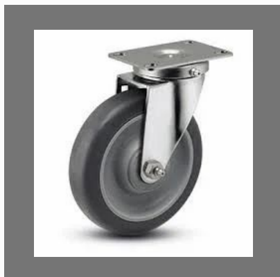
Rubber Castor Wheels