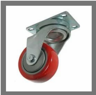
Single PU Caster