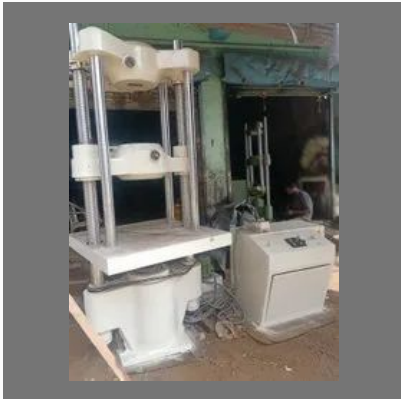
Six pillar Universal testing Machine