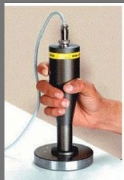
Bias Hand Held Unit