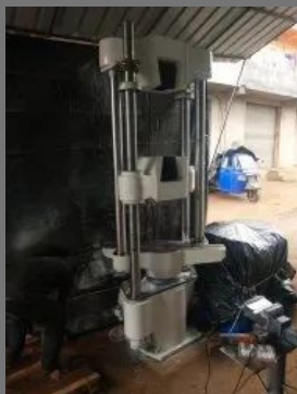
Front Open Hydraulic Jaw Universal Testing Machine 1000 KN As Per ASTM Standards