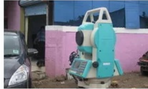
Civil Lab Equipment