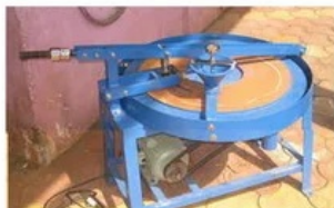
Tile Abrasion Testing Machine