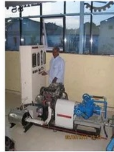
Multi Cylinder Petrol Engine Test Rig