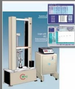
Electro Mechanical Universal Testing Machines Unitek 9400