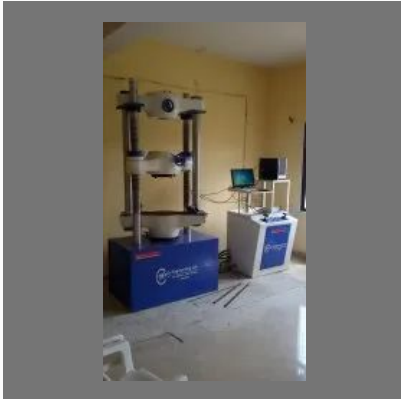
Universal Testing Machine