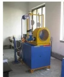
Fluid Mechanics Lab