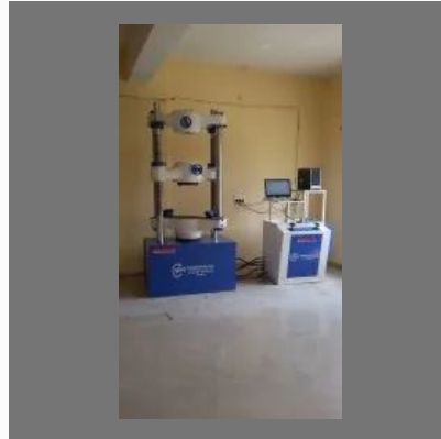
Computerized Universal Testing Machine 1000 Kn