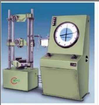
Universal Testing Machines Mechanical