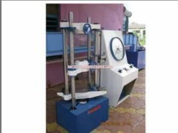
Civil Lab Equipment