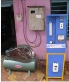
Power Engineering Lab