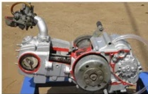
Cut Section Models