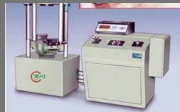
Universal Testing Machines Mechanical