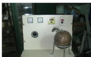
Heat Transfer Lab