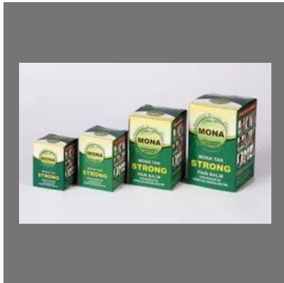
Mona Tan Strong Pain Balm