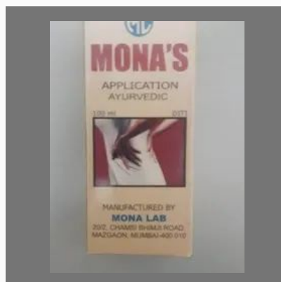
Mona Ayurvedic Pain Oil