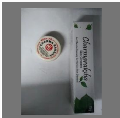
Charmaraksha Skin Ointment