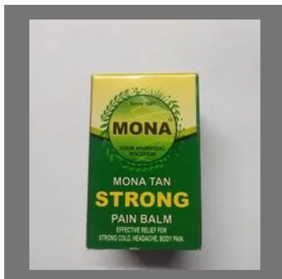
Ayurvedic Tan Stong Pain Balm