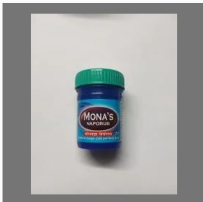
Herbal Cold Balm