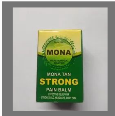
Mona Tan Strong Pain Balm