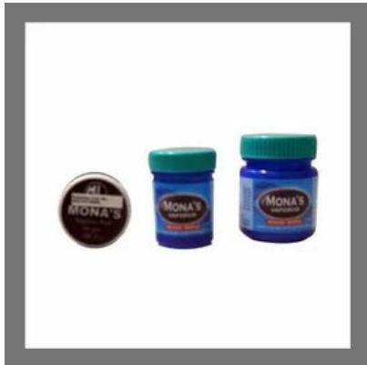
Mona Vaporub Balm