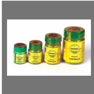
Mona Pain Balm Ointment (For Headache, Cold, Body Pain)