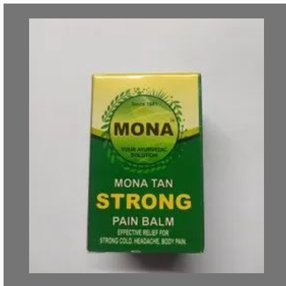
Herbal Body Pain Balm