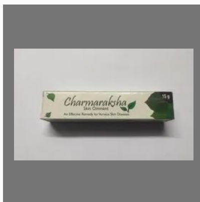
Charmaraksha Skin Ointment