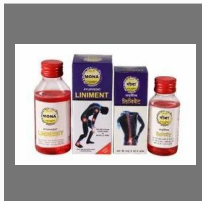
Ayurvedic Liniment (Pain Massage Oil)