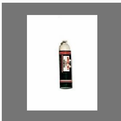
Cold Nasal Inhalers