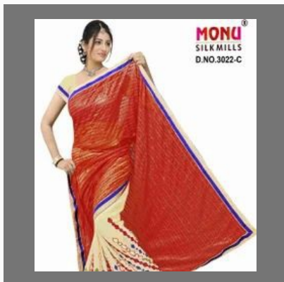
Designer Georgette Saree