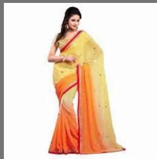
Chiffon Bollywood Saree