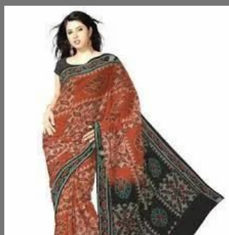
Exclusive Cotton Silk Saree