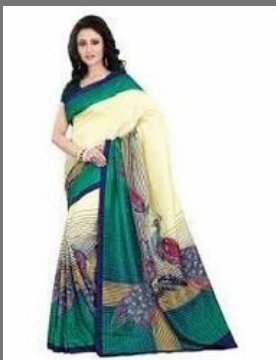
Printed Art Silk Saree