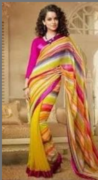
Designer Chiffon Printed Saree