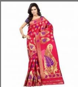
Kanjivaram Silk Saree