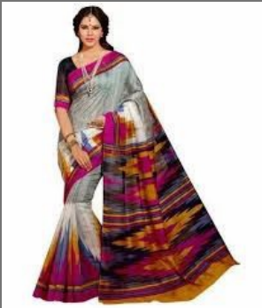
Bhagalpuri Designer Sarees