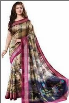
Casual Bhagalpuri Silk Saree