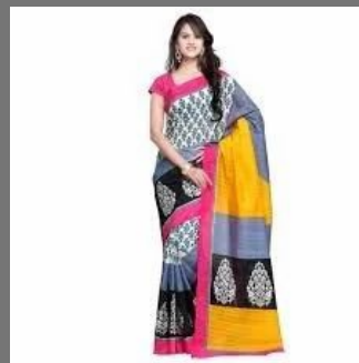
Fancy Art Silk Saree