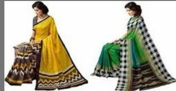
Bhagalpuri Pure Silk Sarees