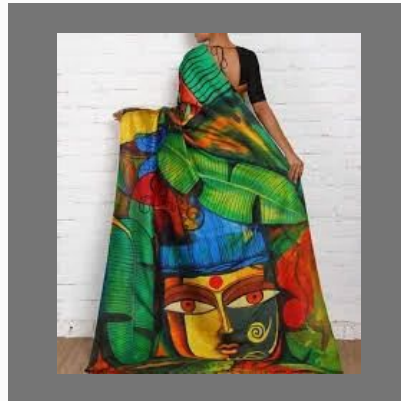
Hand Printed Saree