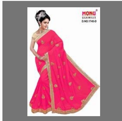
Wedding Bridal Lehenga Saree