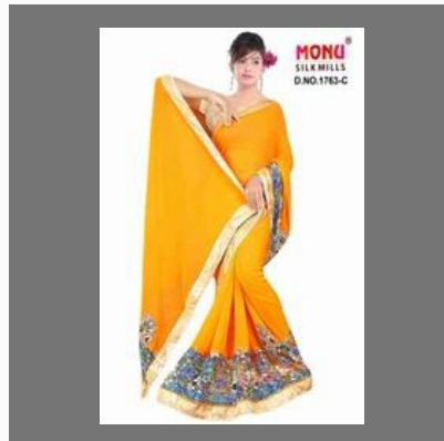
Hand Block Printed Saree