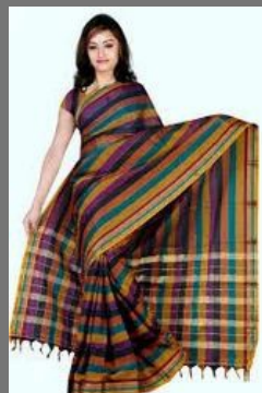
Handloom Cotton Silk Saree