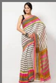
Printed Cotton Sarees