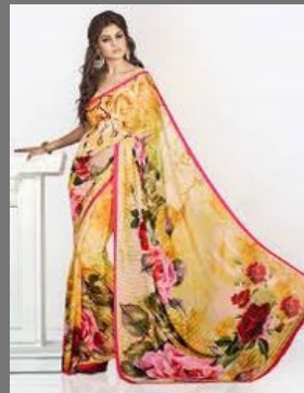
Chiffon Printed Saree