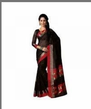
Handloom Designer Saree