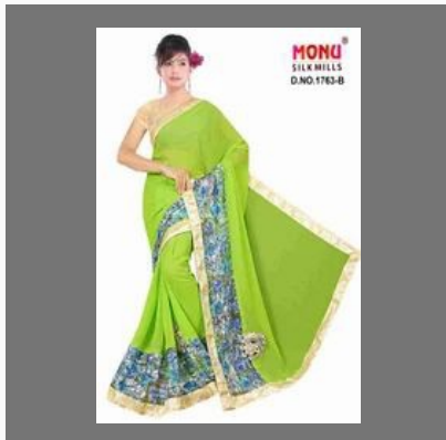
Latest Print Sarees