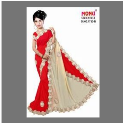
Printed Ethnic Sarees