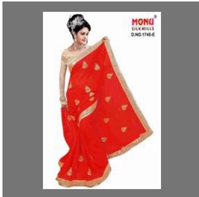
Latest Bridal Lehenga Saree