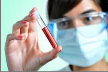
Basic Health Check-Up