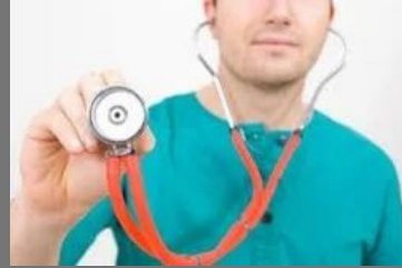
Master Health Check-Up (Men)