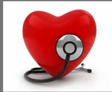
Basic Health Checkup