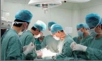
Kidney Transplant Centre