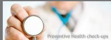
Master Cardiac Health Check-Up