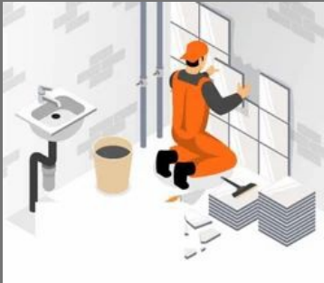
Commercial Building Construction Service