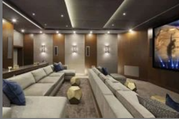
Interior Design Service