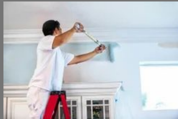
Residential Painting Service