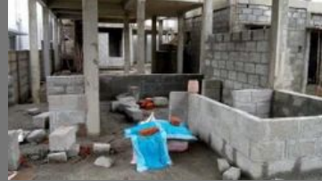
Building Contractor Service