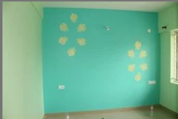
Interior And Exterior Painting Service