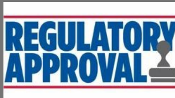
Project Plan Approval