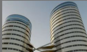
Civil Structural Design Services