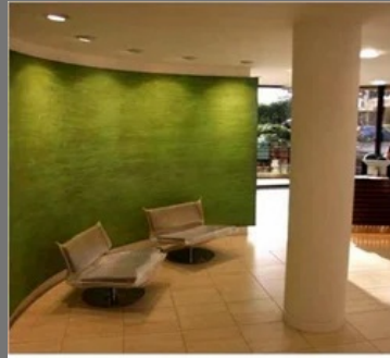
Interior Decoration Service