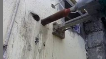
Core Cutting Service