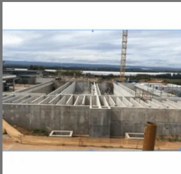
Water Retaining Structure Service