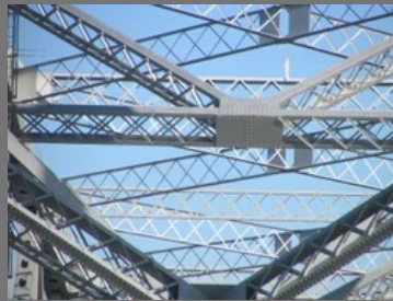
Structure Steel Fabricating Service