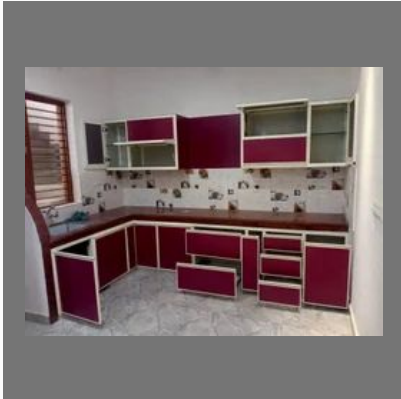
Aluminium Modular Kitchen