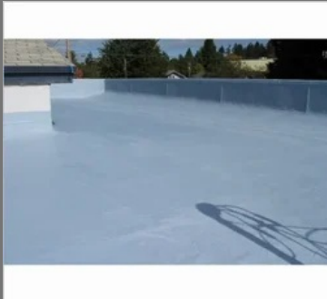
Roof Waterproofing Services