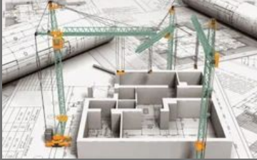
Structural Design Service