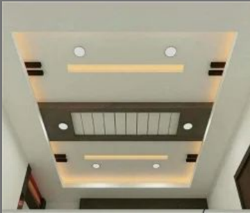
POP Ceiling Work