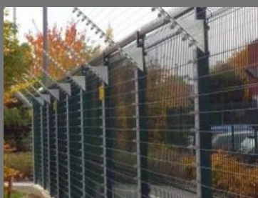
Domestic Electric Fencing