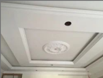
Gypsum Ceiling Work