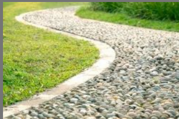
Landscaping Work Service