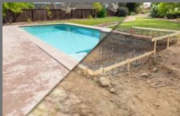
Swimming Pool Construction