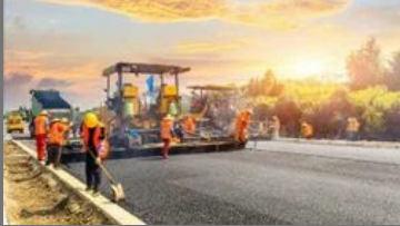
Road Construction Service