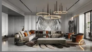
Residential Interior Designer