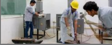
Pavement Design Services