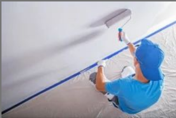
Wall Painting Service