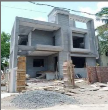
Residential Construction Service