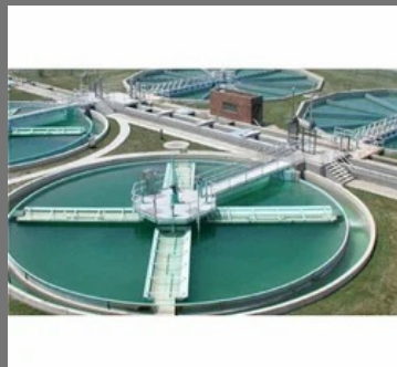
Sewage Treatment Plant Service