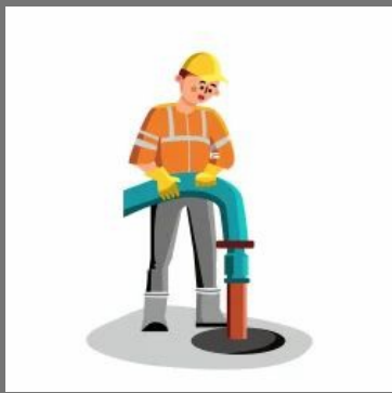
Sewage Treatment Plant Service