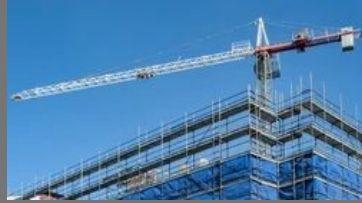
Commercial Building Service