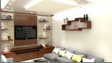
Interior Decoration Services