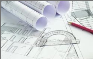
Architectural Designing Services