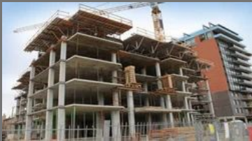
Industrial Building Construction Service