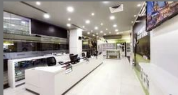
Showroom Interior Designing