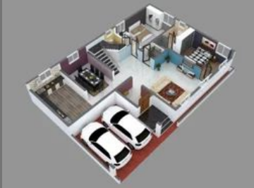
Building Plan Service