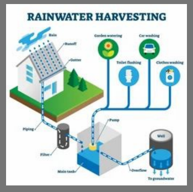
Rain Water Harvesting Service