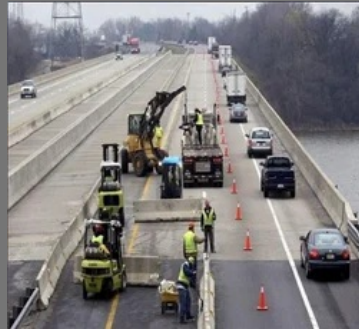
Asphalt Road Construction Services