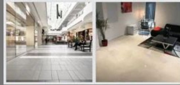
Epoxy Grouting Services