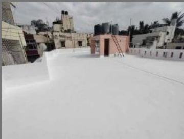
Terrace Water Proofing Services