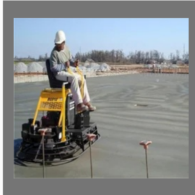
Industrial Floor Cutting Services