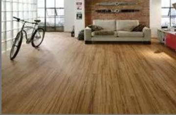
Wooden Flooring Service