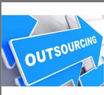
Project Management Outsourcing Services