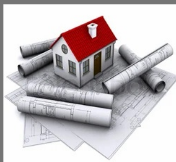
House Construction Services