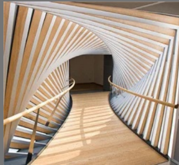
Interior Architectural Services