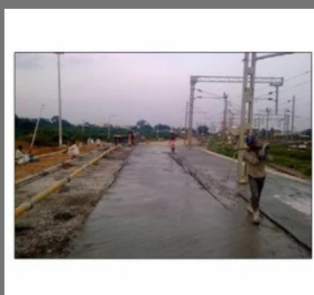
RCC Road Work