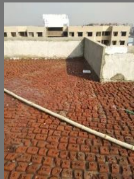
Water Proofing Treatment Service