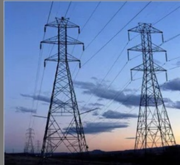
Transmission Line Service