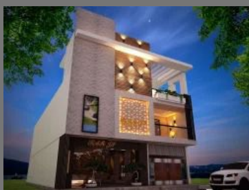
Exterior Elevation Design