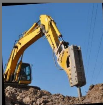
Rock Breaker Renting Service