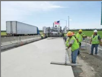
Concrete Road Construction