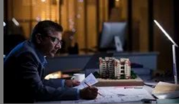
Structural Stability Certification Service