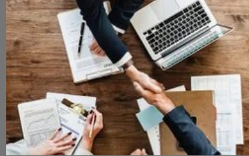
Project Management Service