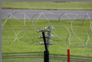
Solar Electric Fencing System