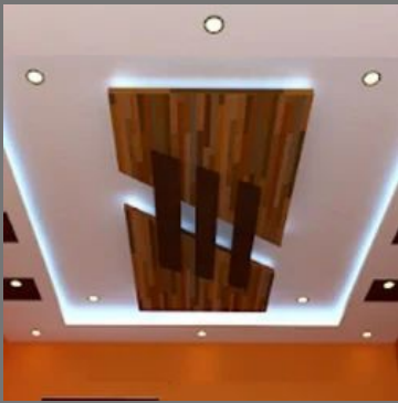
False Ceiling Services