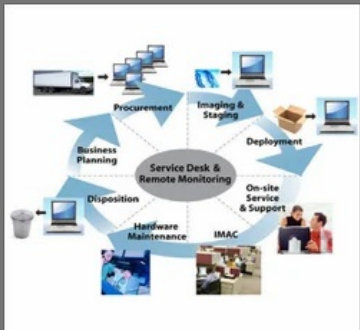
Infrastructure Project Management Service