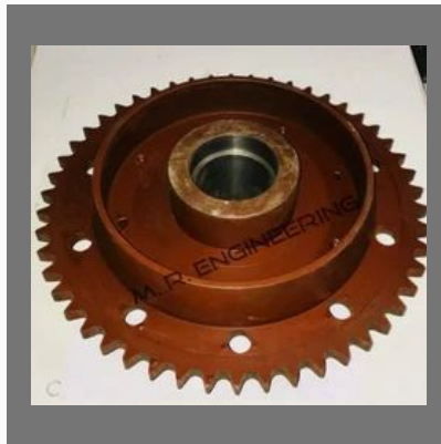
Gear For Scraper 50 T