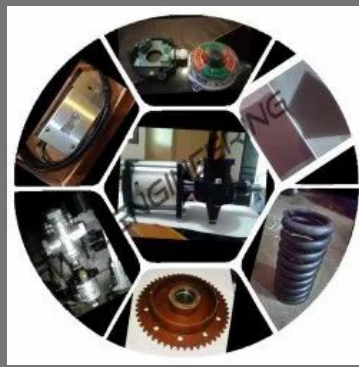
Batching Plant Spares