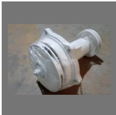
Full Water Pump