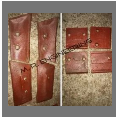
Shovel and Stripper for Batching Plants