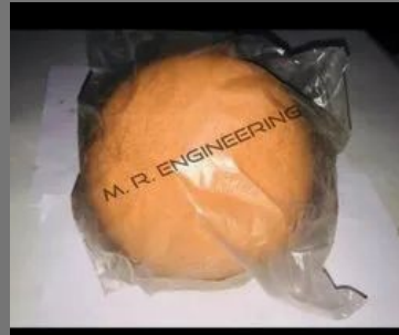
Concrete Pipe Cleaning Ball