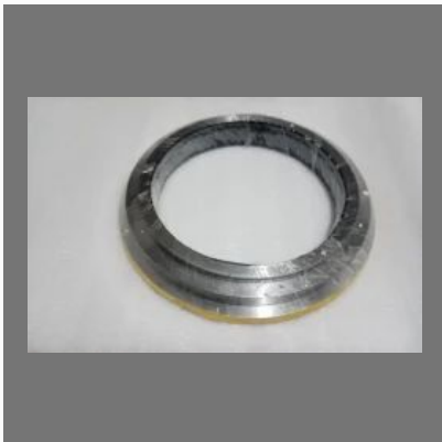
Schwing Stetter Concrete Pump Cutting Ring DN 200 Carbide