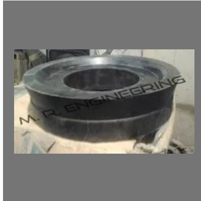
RAM DN 200 for Putzmeister Concrete Pump Parts