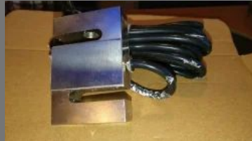
Load Cell S Type 450 Kg