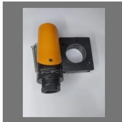
Inductive Proximity Sensor IB 5124