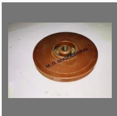
Rotor for Water Pump