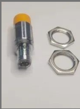
IGS 237 Sensor for Batching Plant