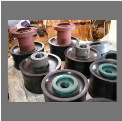
Ram Pump Part