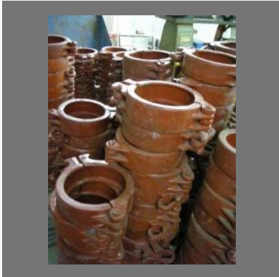
Clamp DN 125 mm