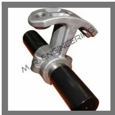
Hanger Bearing for Screw Conveyors