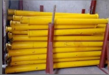
Schwing Stetter Concrete Pump Pipeline