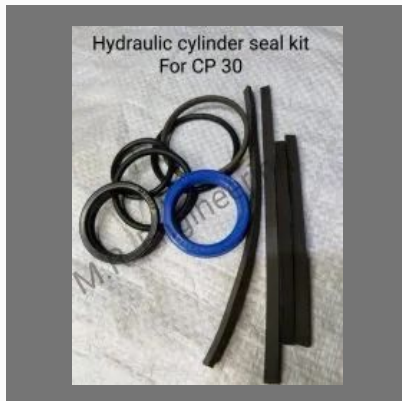
Hydraulic Cylinder Seal Kit For CP 30