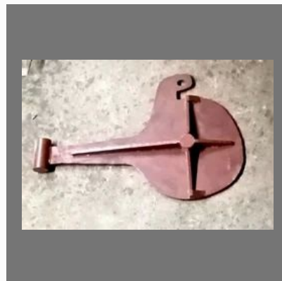
Schwing Stetter Concrete Pump Cover Discharge DN 250 (SP- 1400)