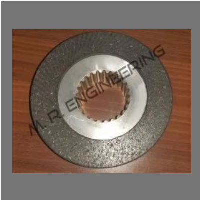
Brake Liner for Nord Motor