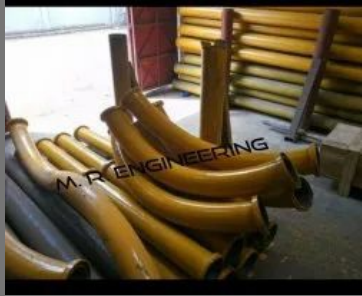
Concrete Pipe Fittings