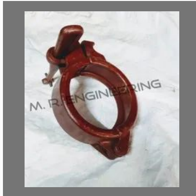
Concrete Pump Pipe Clamp