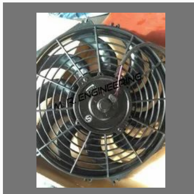
Fan for TM