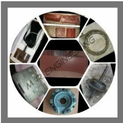
Batching Plant Spare Parts