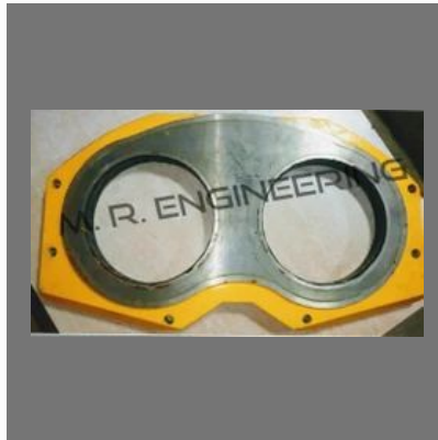
Spectacle Plate For Putzmeister Concrete Pump