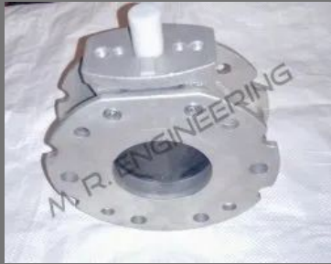
Butterfly Valve 250 mm