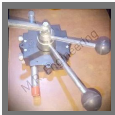
Control Box For T. M. Schwing