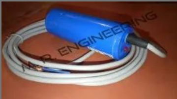
Inductive proximity sensor / switch