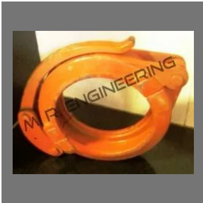
Lever Type Clamp