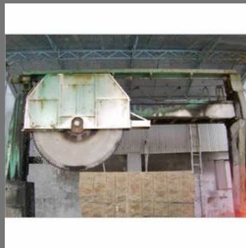
Block Cutter Machine