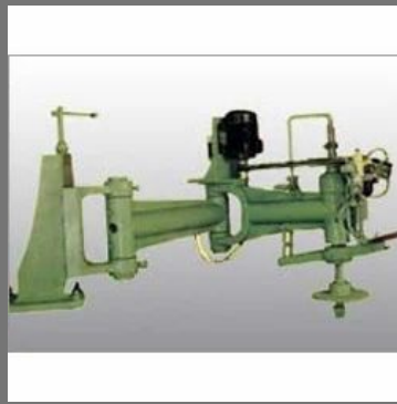
Iron Polishing Machine