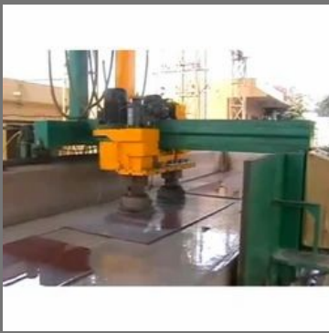
Double Head Polishing Machine