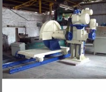
Pillar Type Block Cutting Machine