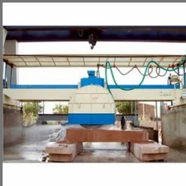
Bridge Type Block Cutter