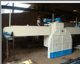
Block Sawing Machine(Alpha)