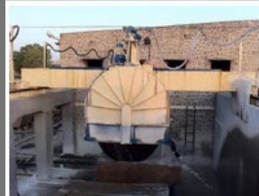
Block Sawing Machine (Jumbo 2.5 Mts)