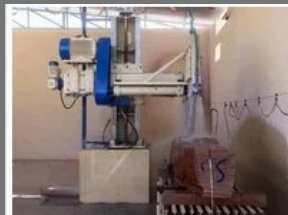
Single Pillar Sawing Machine