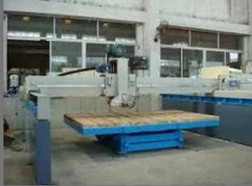
Stone Quarry Cutting Machine