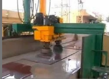
Granite Polishing Machine