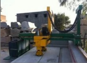
Automatic Stone Polishing Machine