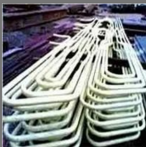
Waterwall Panel Replacement Services