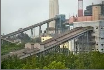
(Maintenance Of Coal Handling Plant 210 MW)