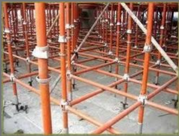
Erection Of Cuplock Scaffolding In Furnace (120mw To 660mw)