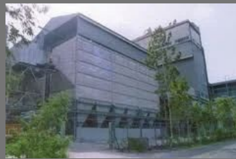
Maintenance And Repair Of ESP