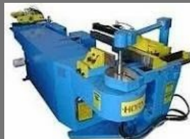
Tube Bending Machine Services