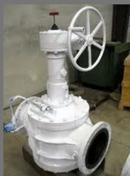
HP Valves Replacement Service