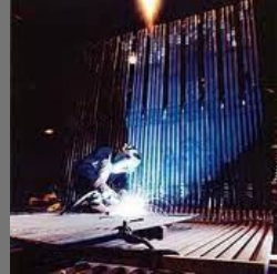
Repair And Maintenance Of Pressure Parts(120mw To 660mw)