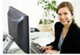
Front Office Executive (Receptionist)