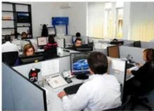
Back Office Executive Recruitment Services