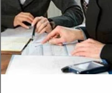
Marketing Executive Recruitment Services