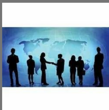
HR Manager Recruitment Services