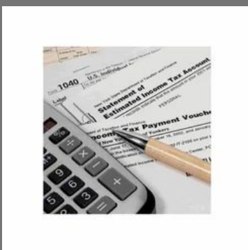
Accountant Recruitment Services