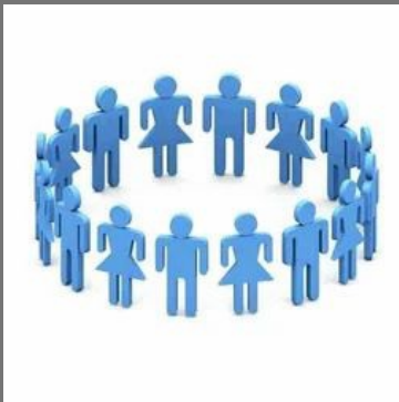
Department Head Manpower Recruitment